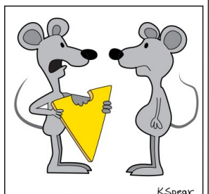
"I hope the church reopens soon. We're nearly through the youth group's snacks."