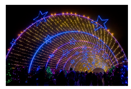
Blue Stars Lois Schubert