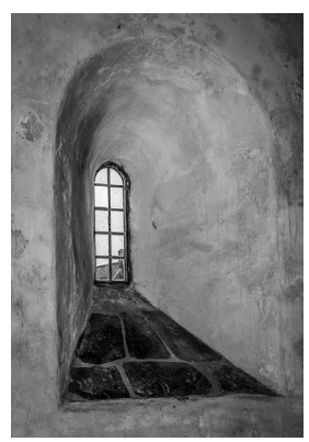
Chapel Window Kathy McCall