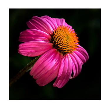
Purle Cone Flower Dolph McCranie