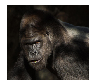
If I Could Get Out of This Cage... Stennis shotts