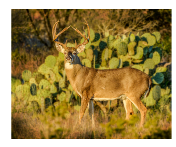
Big Texas Buck Brian Loflin