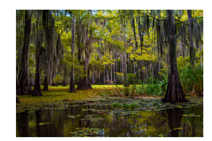
Caddo Lake Beverly Lyle