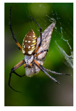
Black and Yellow Argiope Beverly McCranie