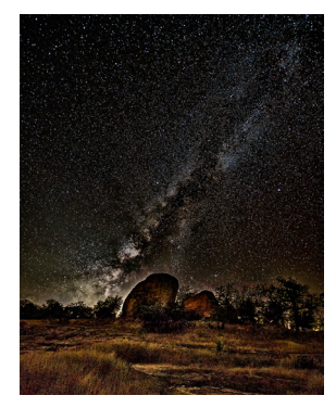
Milky Way - Mason, TX