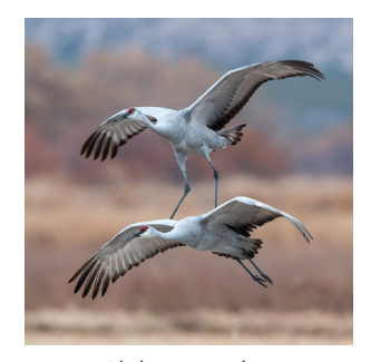
Gliding Together Haytham Samarchi