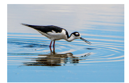
Black Necked Stilt Dolph McCranie