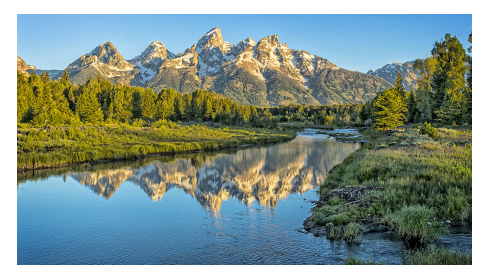
Reflection on the Snake Paul Munch