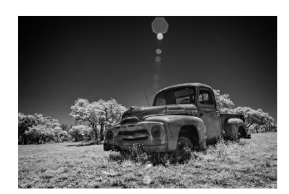
Vintage Truck Rose Epps