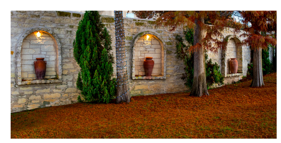
Villas Fall Fence Beverly Lyle