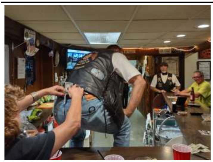
The "Legiondales" really work had to earn their tips! All tips given on Tuesdays (Riders Bartender Nights) goes to the Legion Riders charitable giving.