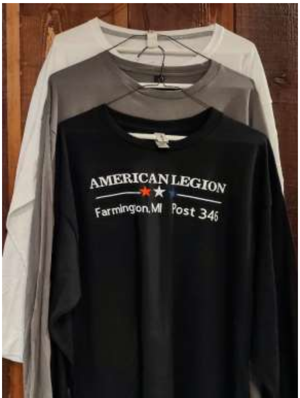
See samples in the clubroom, long sleeves, asst. colors and sizes, $25 each

The world is filled with nice people. If you can't find one, be one.