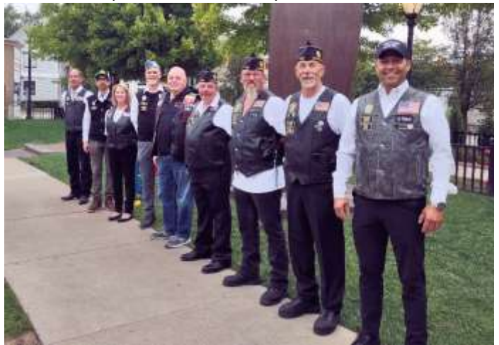
Members of our Legion Riders Chapter 346 were in attendance and looking sharp.