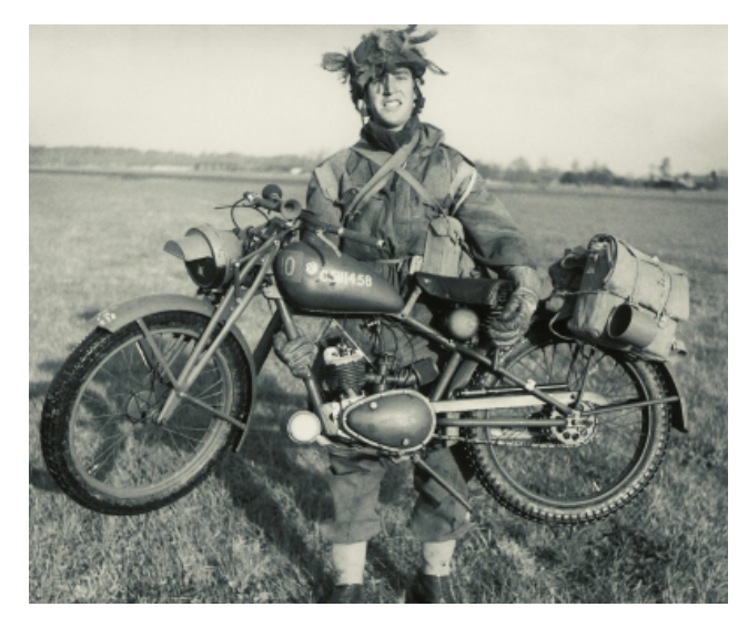
Royal Enfield RE/WD Flying Flea 125 Parachute Motorcycle. It was manufactured at Royal Enfield's underground facility in Westwood, UK, during World War II.

Portland Chapter on the third Saturday of Every Month at noon at See See Coffee at 1642 Sandy Blvd., Portland, OR http://www.vmemc.org