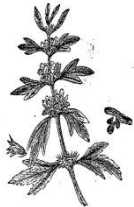
Leonurus Cardiaca. (Motherwort).

Dog days of summer are here. Certain constellations during these days between July and early September are said to depict images of dogs. I haven't done much sky watching lately but have noticed lots of bees and butterflies. Joli's bees are all over her Motherwort ( Leonurus cardiaca ) I've seen this plant but had not realized that it is an important honey bee plant. Its leaves are hairy and