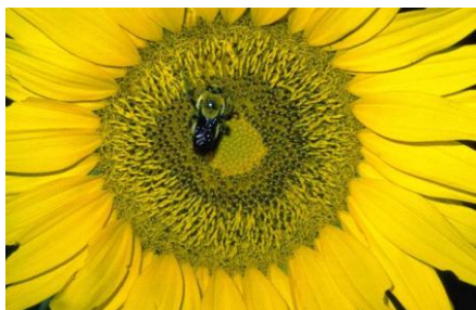
The Kansas Honey Producers Fall Meeting October 30 & 31, 2015

Directions: The address is 2110 Harper St. It is easily accessible from K10, turn north on Harper Street and it is just a few blocks. We are in Building 21 North which will be on your left you turn into the fairgrounds.