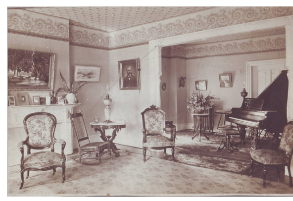
The Brick Tavern Parlor, circa 1900.

on hand to discuss his NYSCA grant-funded project of Schuyler County "then and