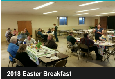
2018 Easter Breakfast

Freewill offering to benefit the youth fund.