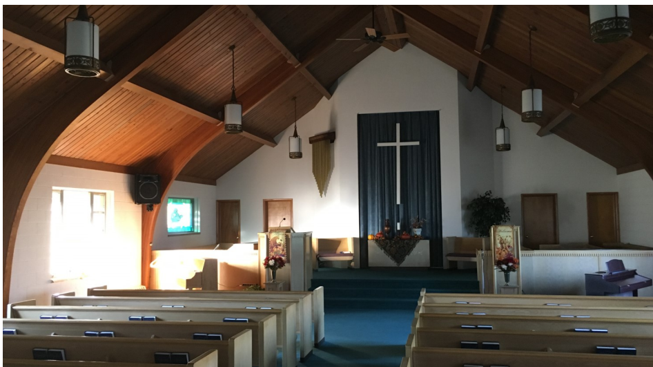
Wabash CoB Sanctuary

We welcome all who are on the journey to know Jesus, who share in his love and who choose to embrace the diversity within this community of believers. As individuals we may be at different places along the path, but as a community, we are all traveling together in faith, trusting God to show us the way.