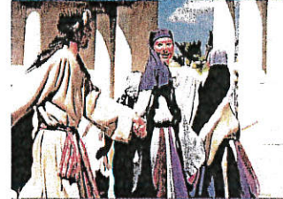
The Holy Land Experience