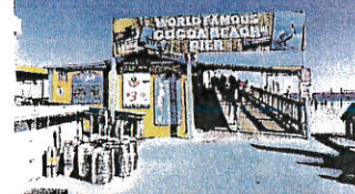
Cocoa Beach Pier