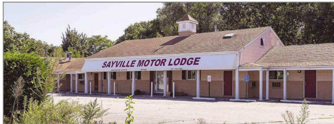
The Sayville Motor Lodge, which was shuttered in November after sex trafficking and drug charges were issued to its owners and other defendants, was sold for $2 million, federal prosecutors said.

The traffickers, sex workers and drug dealers called the hus-