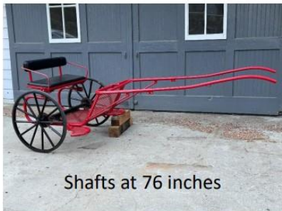
Shafts at 76 inches