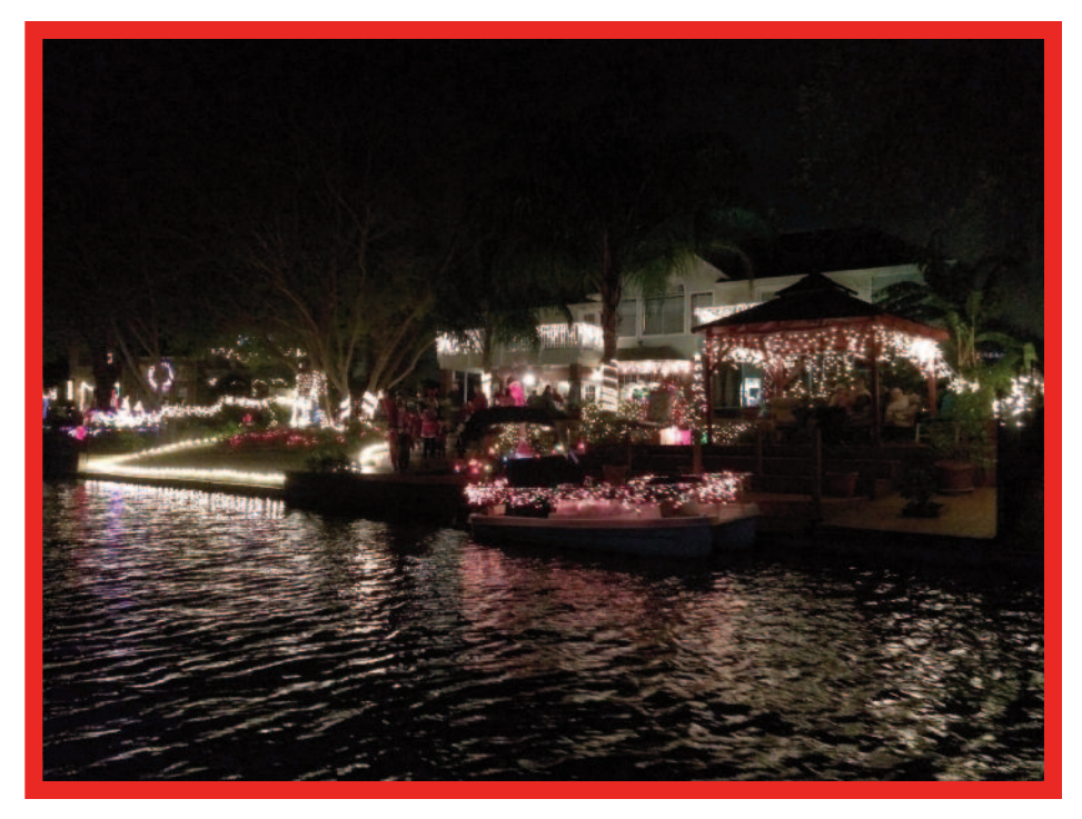
Armando & Alina Solorzano at 14015 Ragus Lake Drive