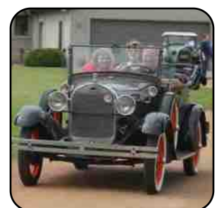
The Gerolds on tour