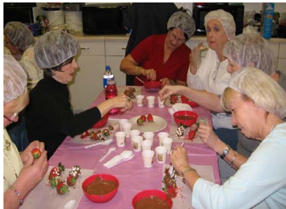
Photos from Valentine's Day Candy Making