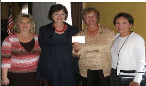
Left: Guests and new members attending the luncheon. Sorry, we did not get names....