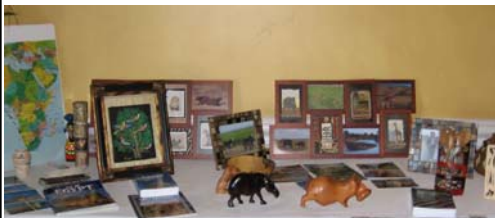
Left: Souvenirs from the trip brought to the luncheon