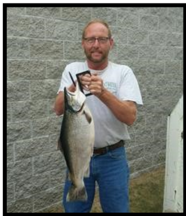
Highway Man - 9.70# Brown - 7/11/18