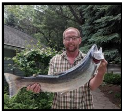
Highway Man - 14.75# Steelhead - 7/5/18

"It always seems impossible until it's done"