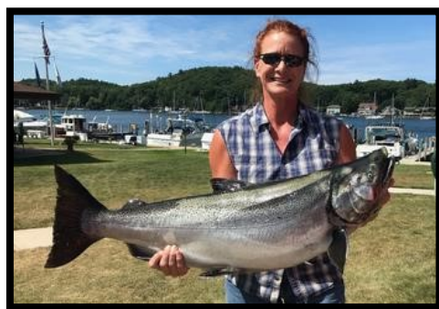
Last Cast - 32.10# King Salmon 8/10/18

Annual Big Fish Contest @ www.pentwaterpsa.org under the "Events" page.