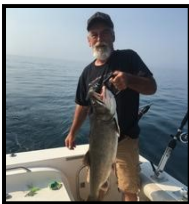
Carpe Diem II - 16.50# Lake Trout - 8/13/18