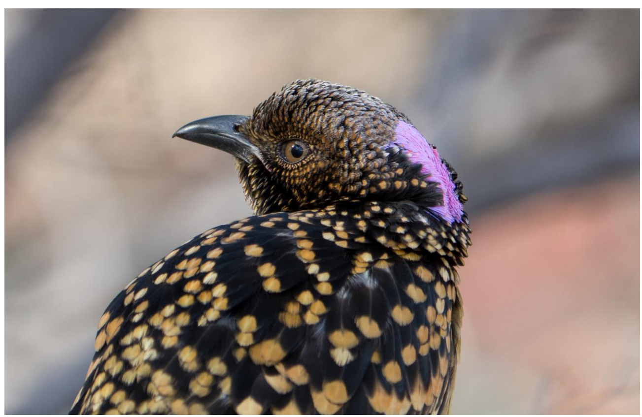
Western Bowerbird [Olive Pink Botanic Garden]