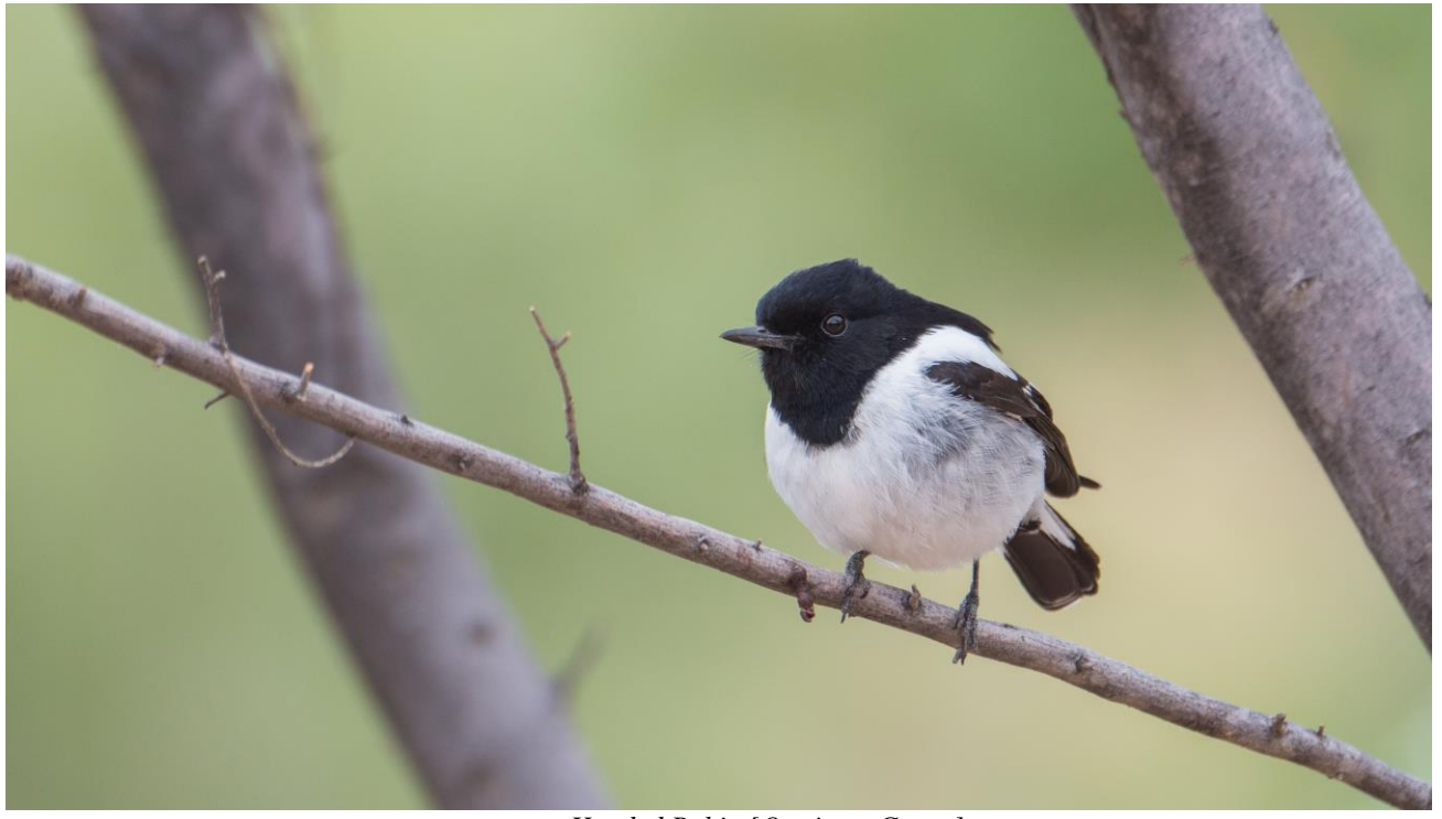
Hooded Robin [Ormiston Gorge]