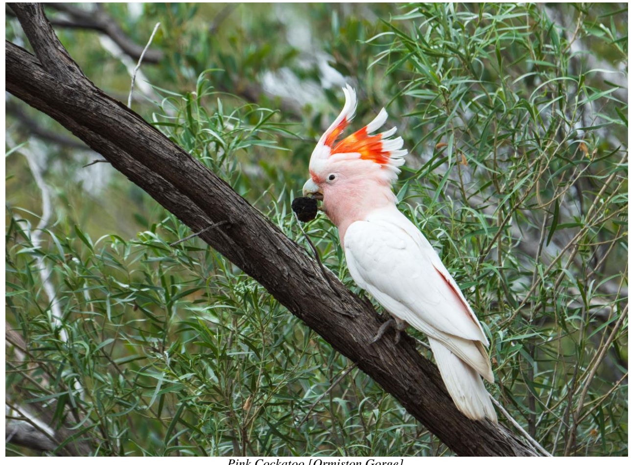
Pink Cockatoo [Ormiston Gorge]