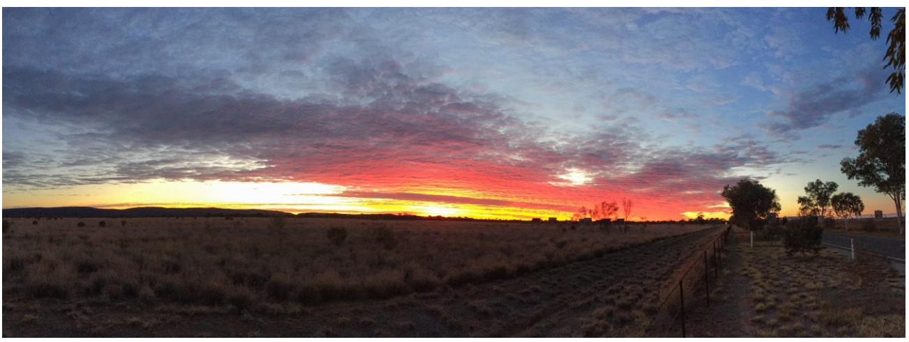
Sunrise over the south-eastern outskirts of Alice Springs