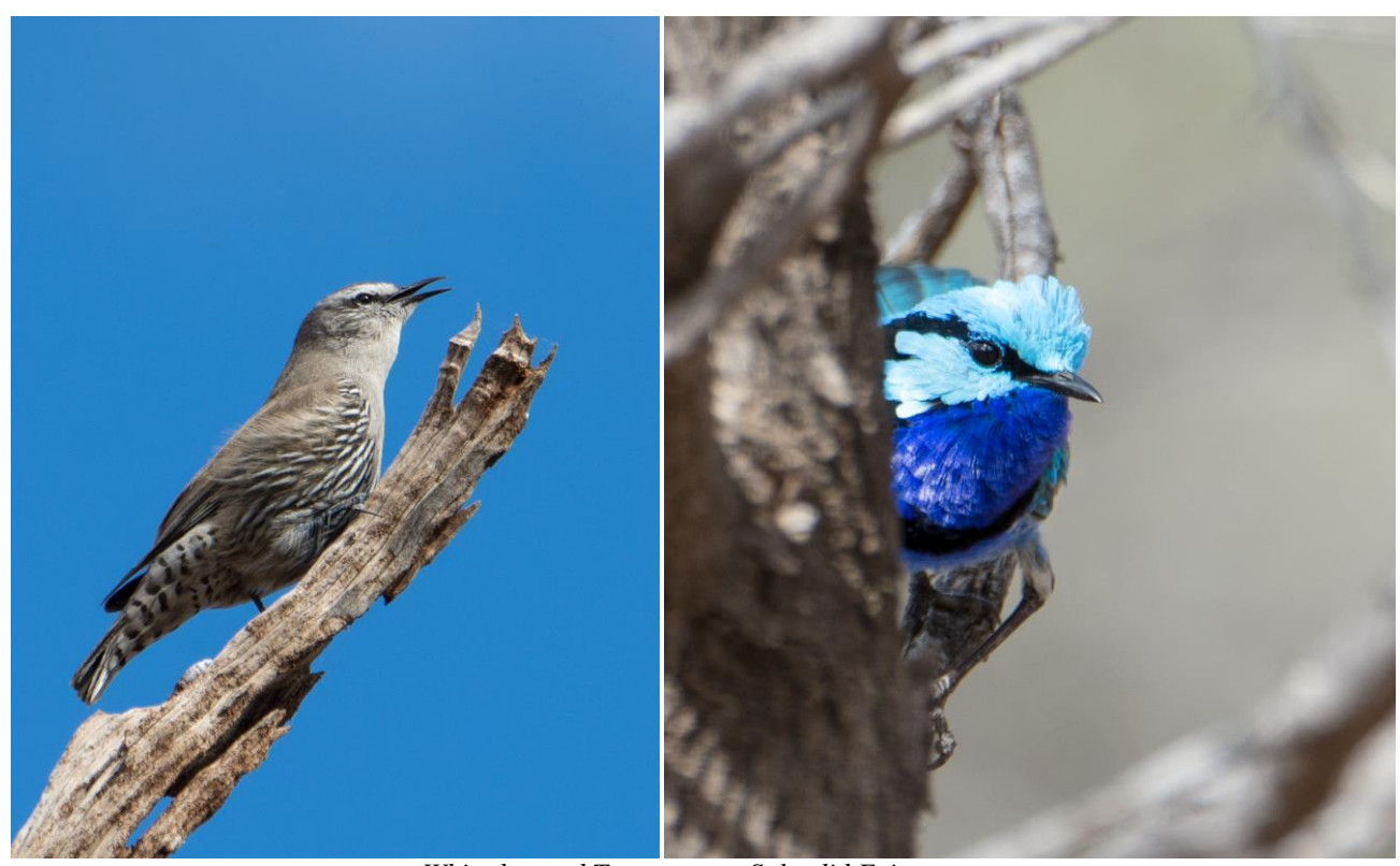
White-browed Treecreeper; Splendid Fairywren