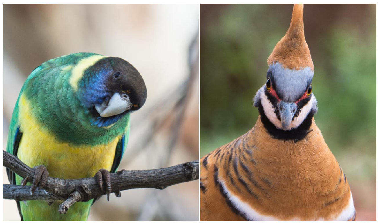
Port Lincoln Parrot [Alice Springs]; Spinifex Pigeon [Ormiston Gorge]