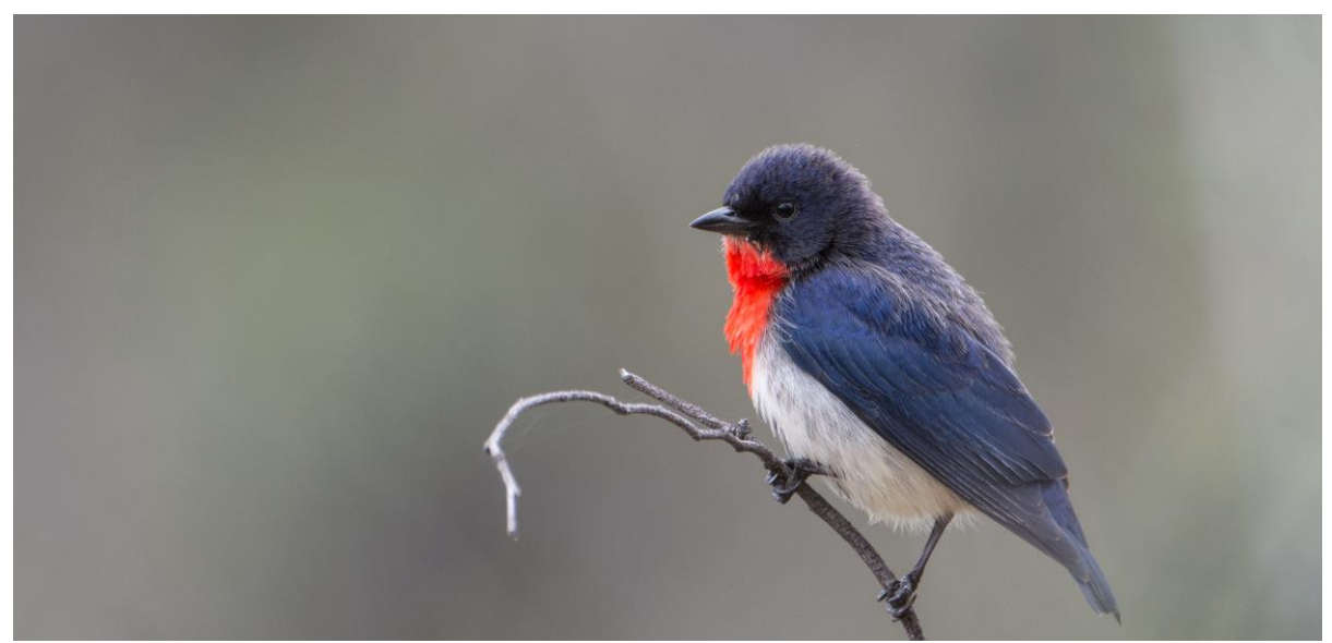
Mistletoebird [Ormiston Gorge]