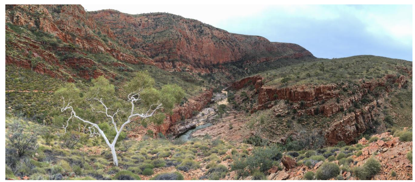
Ghost gum above Ormiston Gorge