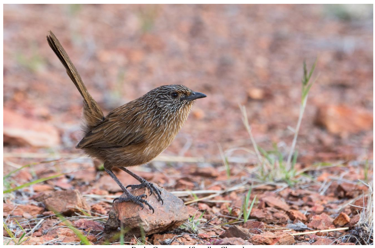
Dusky Grasswren [Standley Chasm]