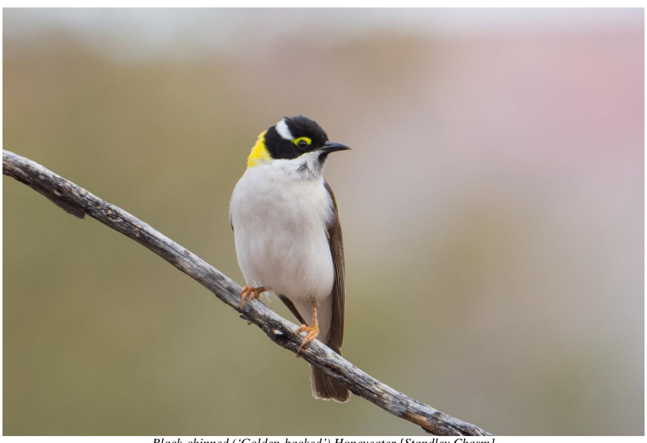
Black-chinned ('Golden-backed') Honeyeater [Standley Chasm]