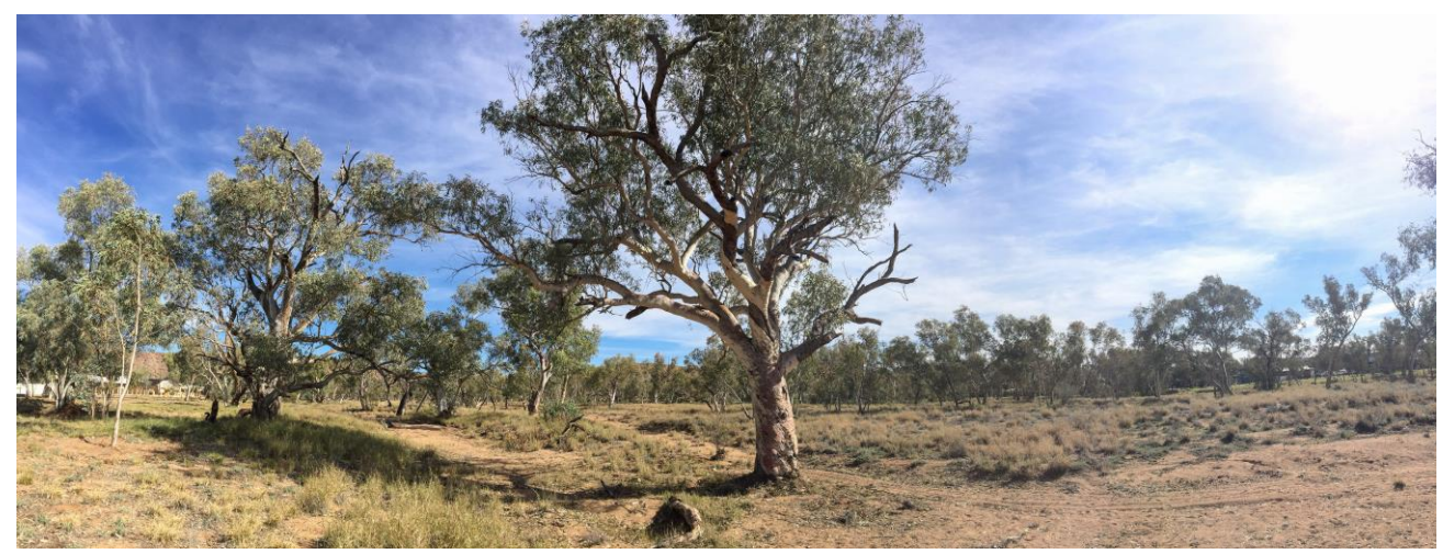
The dry bed of the Todd River, Alice Springs