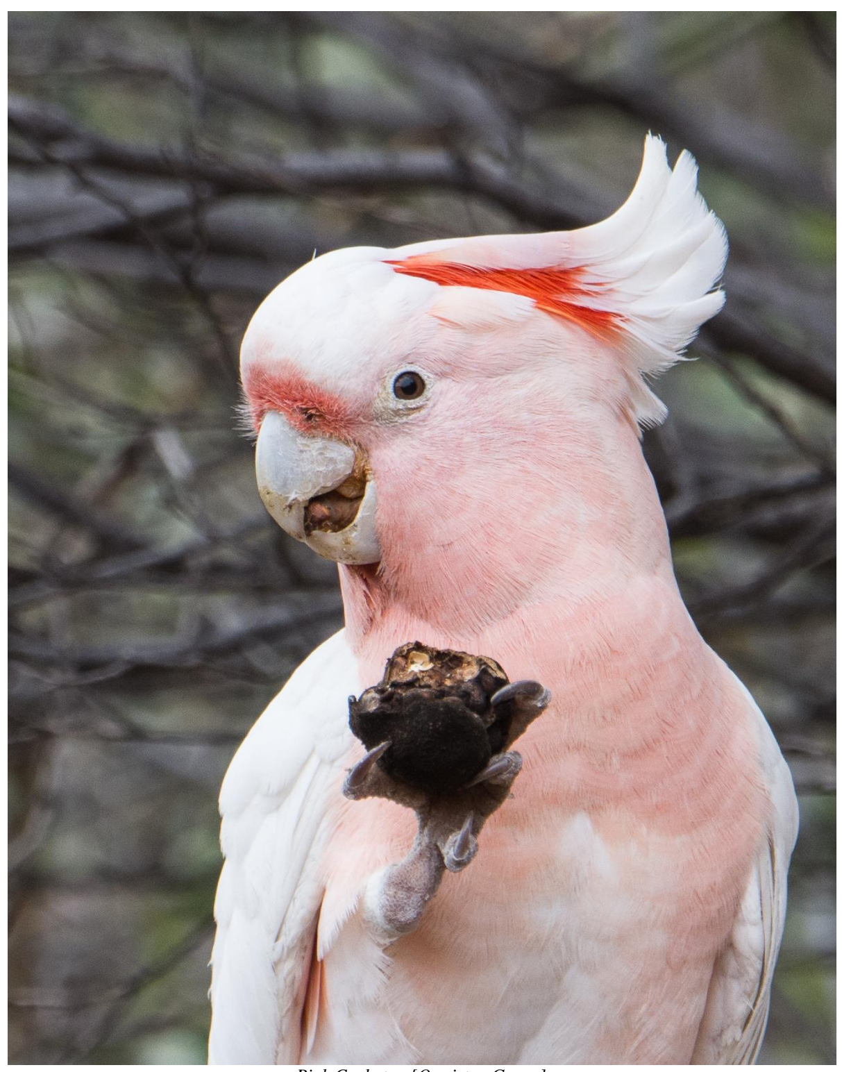
Pink Cockatoo [Ormiston Gorge]