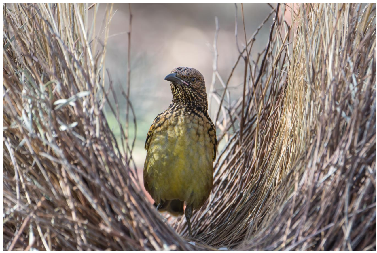
Western Bowerbird at his bower [Olive Pink Botanic Garden, Alice Springs]