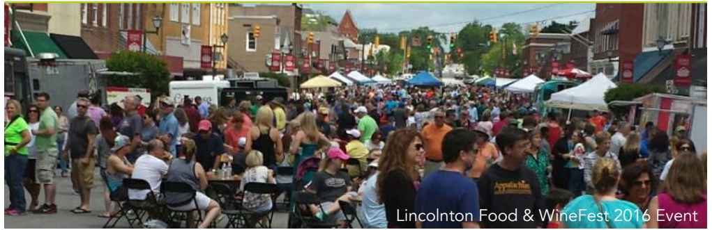
Lincolnton Food & WineFest 2016 Event