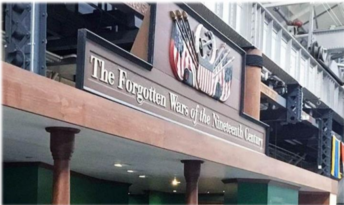
An exhibit, available online, at the National Museum of the U.S. Navy.