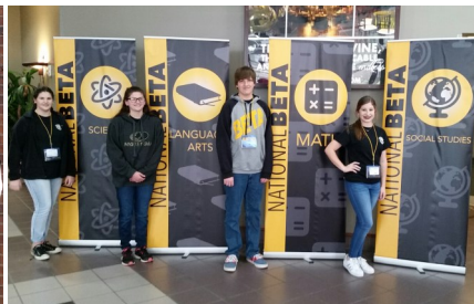
Junior Beta attending their convention!