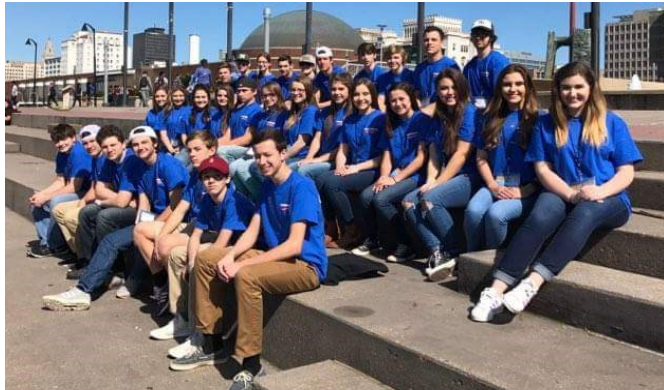
Senior Beta attending Louisiana Senior Beta Convention in Baton Rouge, LA!