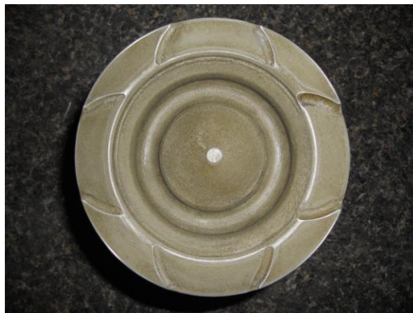
Figure 3: The Top of a Piston Coated with AdiaBlock and Sealed with Thermo-Seal