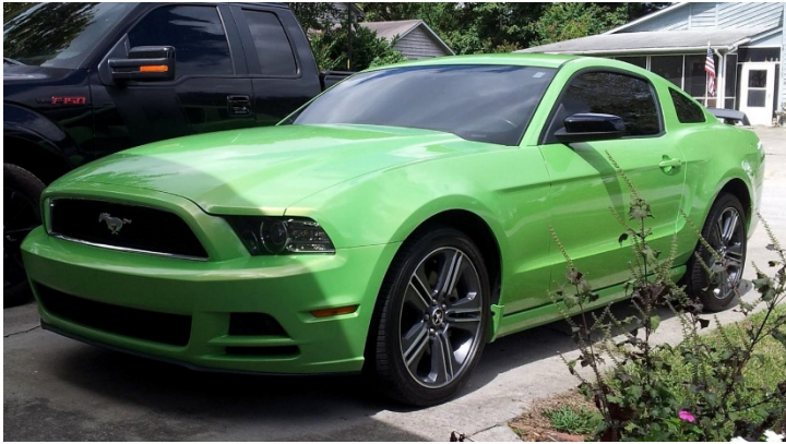
Sherry's 2013 Mustang!