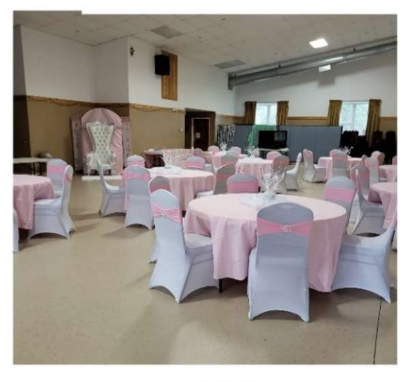
Sweet 16 Party