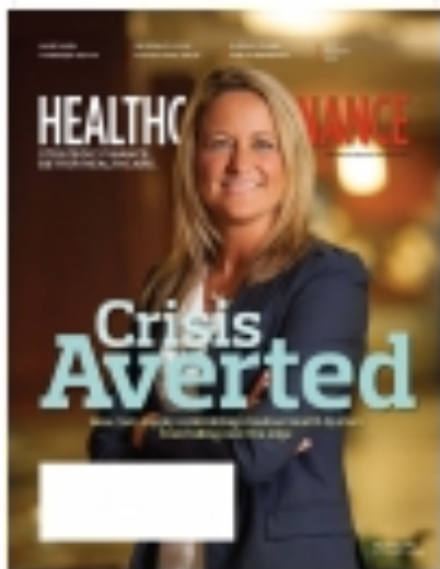
( http://www.healthcarefinancenews.com/issue/july-august-2015-1 )

About (/about-healthcare-finance-news) Editors (/editorial-staff) Privacy Policy (/privacy-policy) Reprints ( http://reprints.ygsgroup.com/m/healthcarefinancenews/ ) Advertising ( http://www.himssmedia.com/advertising-specs )