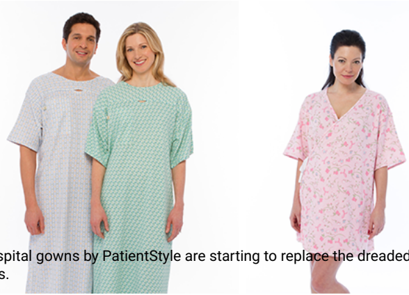
Updated hospital gowns by PatientStyle are starting to replace the dreaded, bottom-bearing ones.

Chuck Green (/news/author/2621) (/news/author/2621)