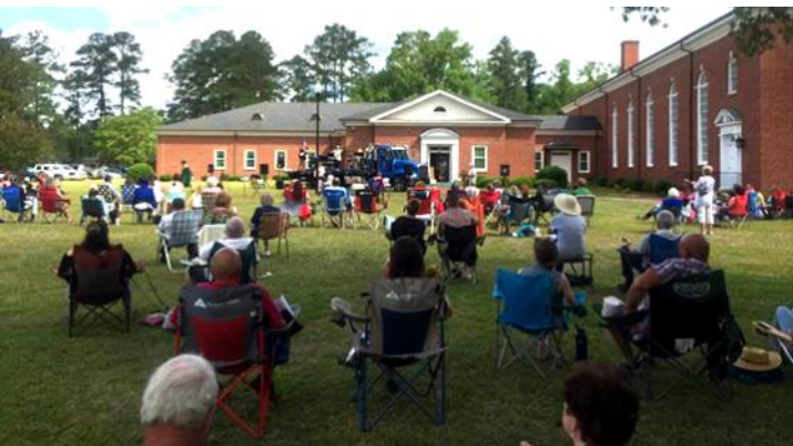
Outdoor Worship Service, May 17, 2020

Please continue to lift up your church staff in prayer as we make adjustments week by week!