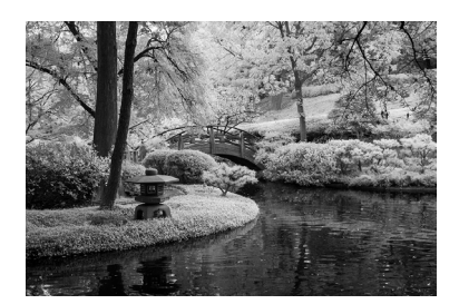
Japanese Garden Lois Schubert