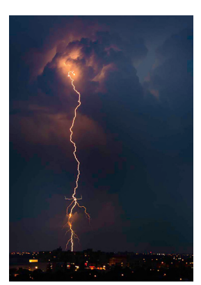
Lightening in Lauderdale Stennis Shotts