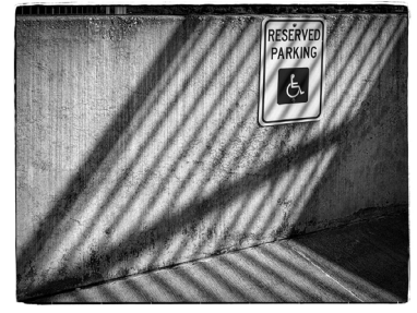
Reserved Parking Rose Epps