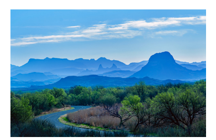
Morning in Big Bend Beverly Lyle