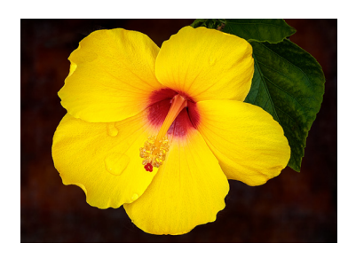
Yellow Hibiscus Rose Epps