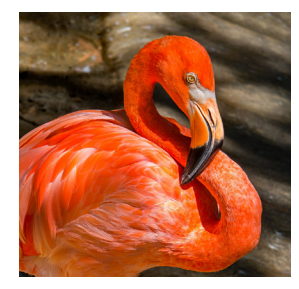
Hot Pink Beverly Lyle