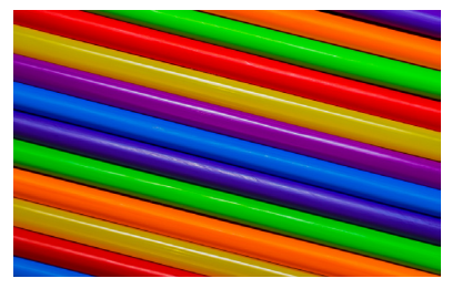
Colorful Stripes Bruce Lande