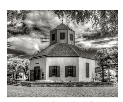
Vereins Kirche, Fredericksburg Pete Holland