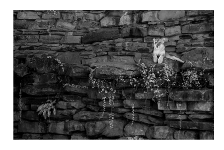
Lioness, Ft Worth Zoo