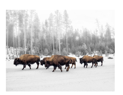
Bison - Yellowstone Phil Charlton