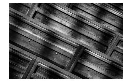
Church Pews Jeff Lava