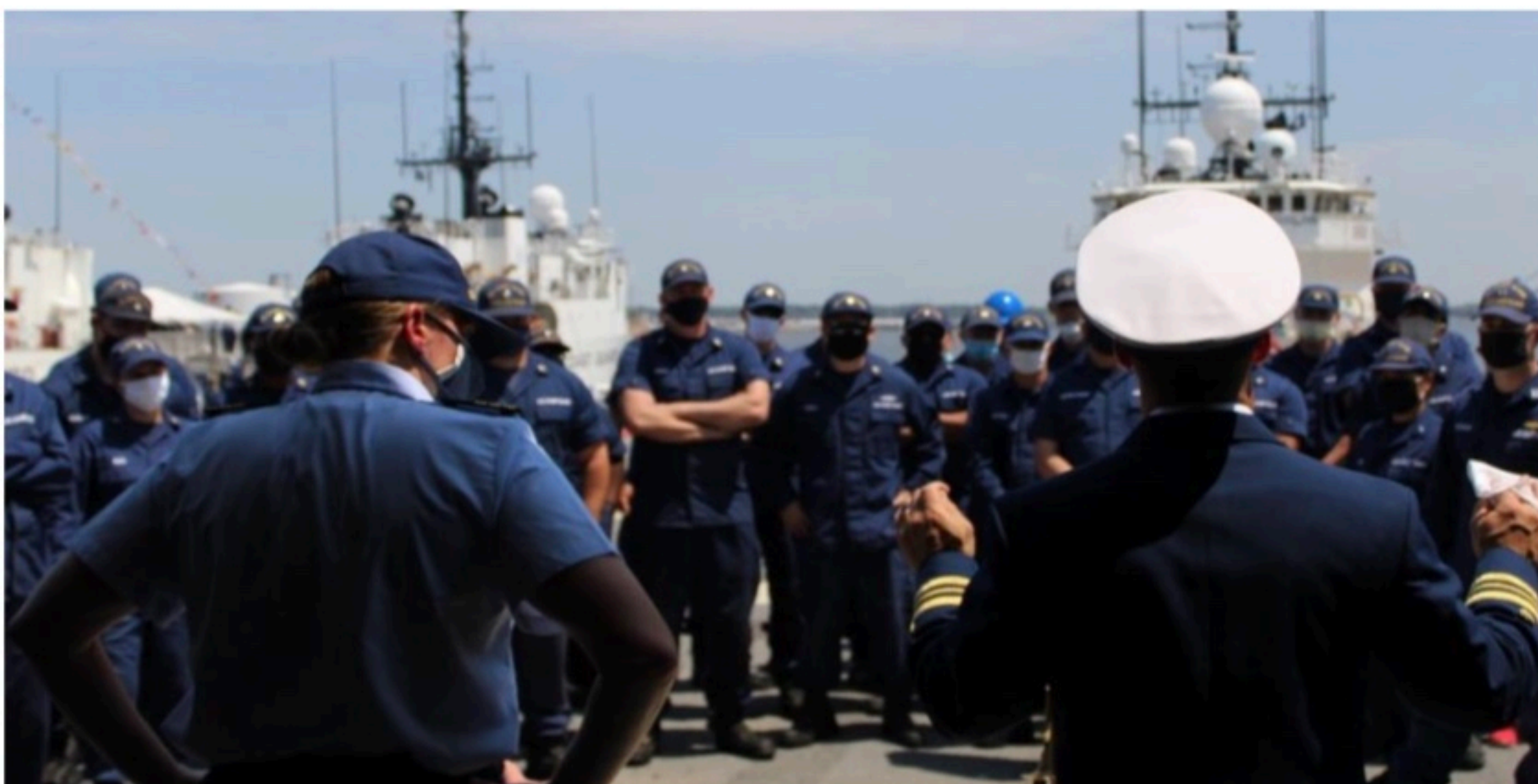
"All Hands" muster on NORTHLAND's helicopter deck

Get your foursomes together for a fun day of golf. Cost per player is $85 which includes green fee, cart, lunch, snacks, soft drinks and adult refreshments served by courtesy carts. ✍