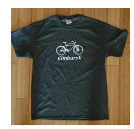
$20 Donation Short-sleeve T-shirt Available in various sizes and colors