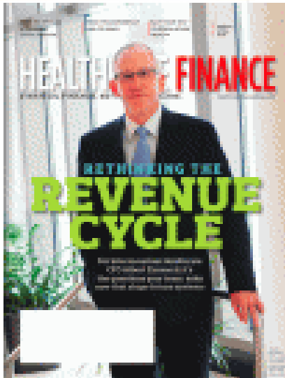
( http://www.healthcarefinancenews.com/issue/march-april-2015-0 )