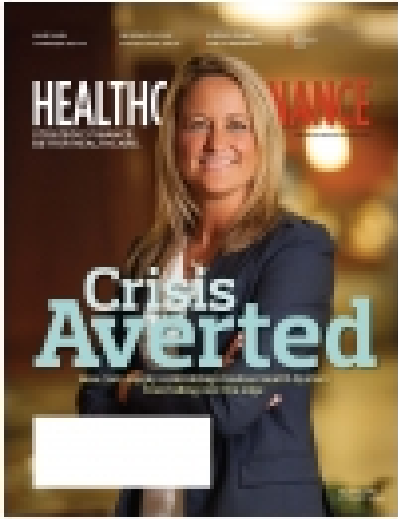
( http://www.healthcarefinancenews.com/issue/july-august-2015-1 )