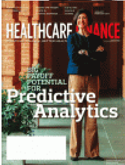
( http://www.healthcarefinancenews.com/issue/january-february-2015-0 )