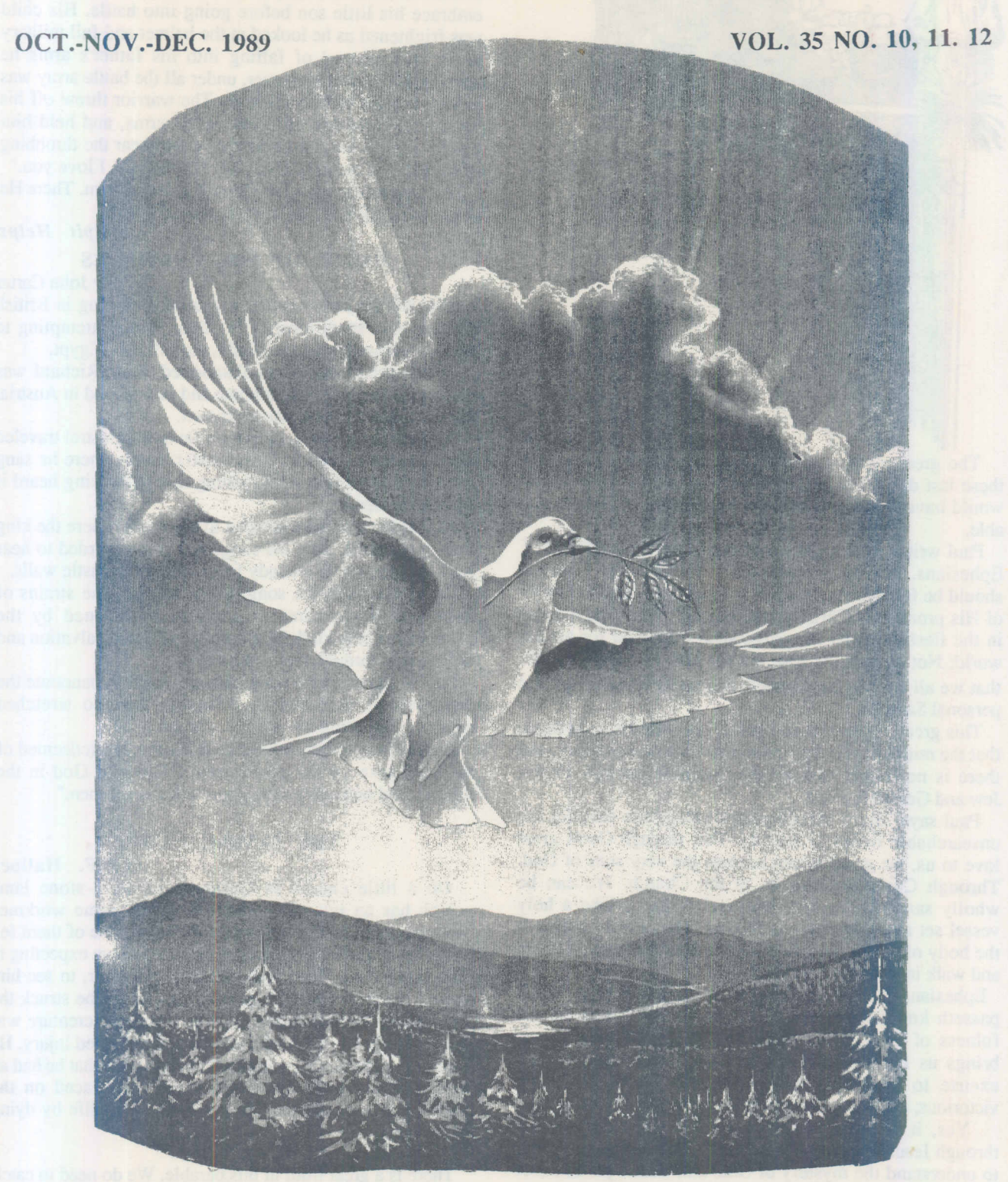
..And there came a voice from heaven saying, Thou art my beloved Son, in whom I am well pleased. Mark 1:11