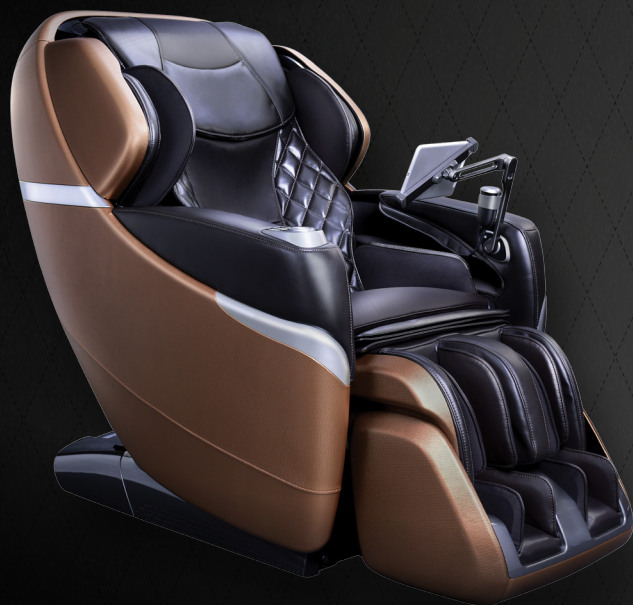
ESPRESSO & VINTAGE COPPER (CZ-730/Qi EVC)

Weight Capacity: 315lbs Product Weight: 260lbs