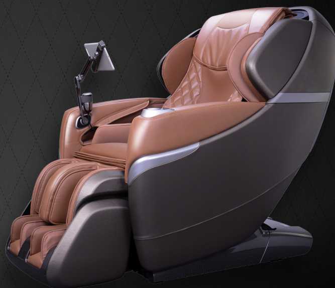
CARAMEL & ANTIQUE BRASS (CZ-730/Qi CAB)