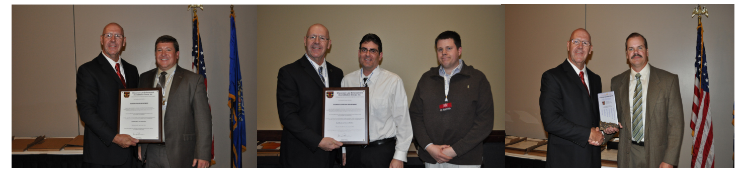
Core Standards Verified January 2014 - Village of Jackson PD