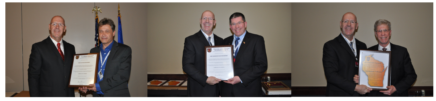
Accredited 2013 West Allis PD