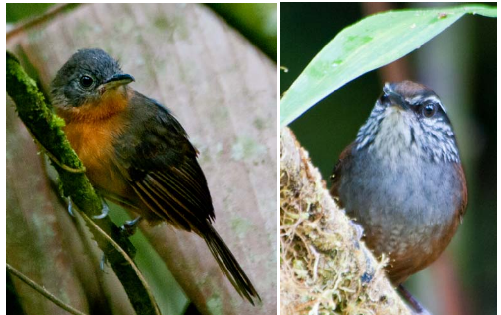
Parker's Antbird [female] (roadside near Urrao); Munchique Wood-Wren (roadside at El M near Las Tángaras)