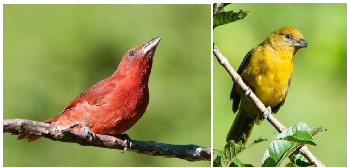
Hepatic Tanager [male & female] (both RNA Las Tángaras)