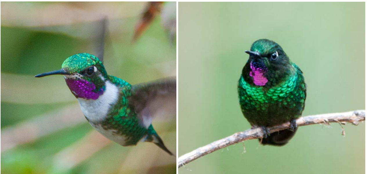
White-bellied Woodstar; Tourmaline Sunangel (both RNA Colibrí del Sol)