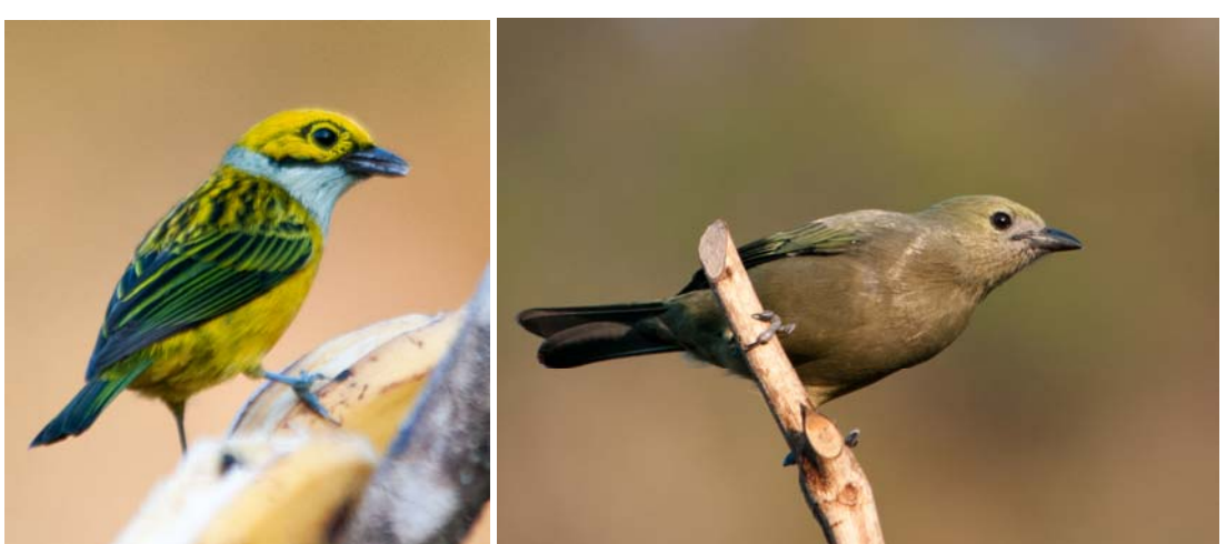
Silver-throated Tanager; Palm Tanager (both RNA Arrierito Antioqueño)

Personal highlights included securing great views of several spectacular 'lifer' tanager species, especially the mixed flocks at Arrierito Antioqueño and the Bangsia endemics at Las Tángaras; the large number of tapaculos and antpittas that I was able to see well despite their skulking habits - including close-up views of Ocellated Tapaculo at Colibrí del Sol (a 'bogey bird' that had until now eluded me on numerous occasions) and the almost inconceivable comfort with which the Urrao/Fenwick's Antpitta accepted my presence whilst it ran backwards and forwards carrying worms to two juveniles that were hiding in the bamboo undergrowth); seeing a large troop of endangered White-footed Tamarins climbing trees near to Arrierito Antioqueño; visiting the incredibly moss laden world at the edge of the Páramo del Sol; and the opportunity to boost my fitness thanks to the long days of hiking at altitude in these impressive forests!