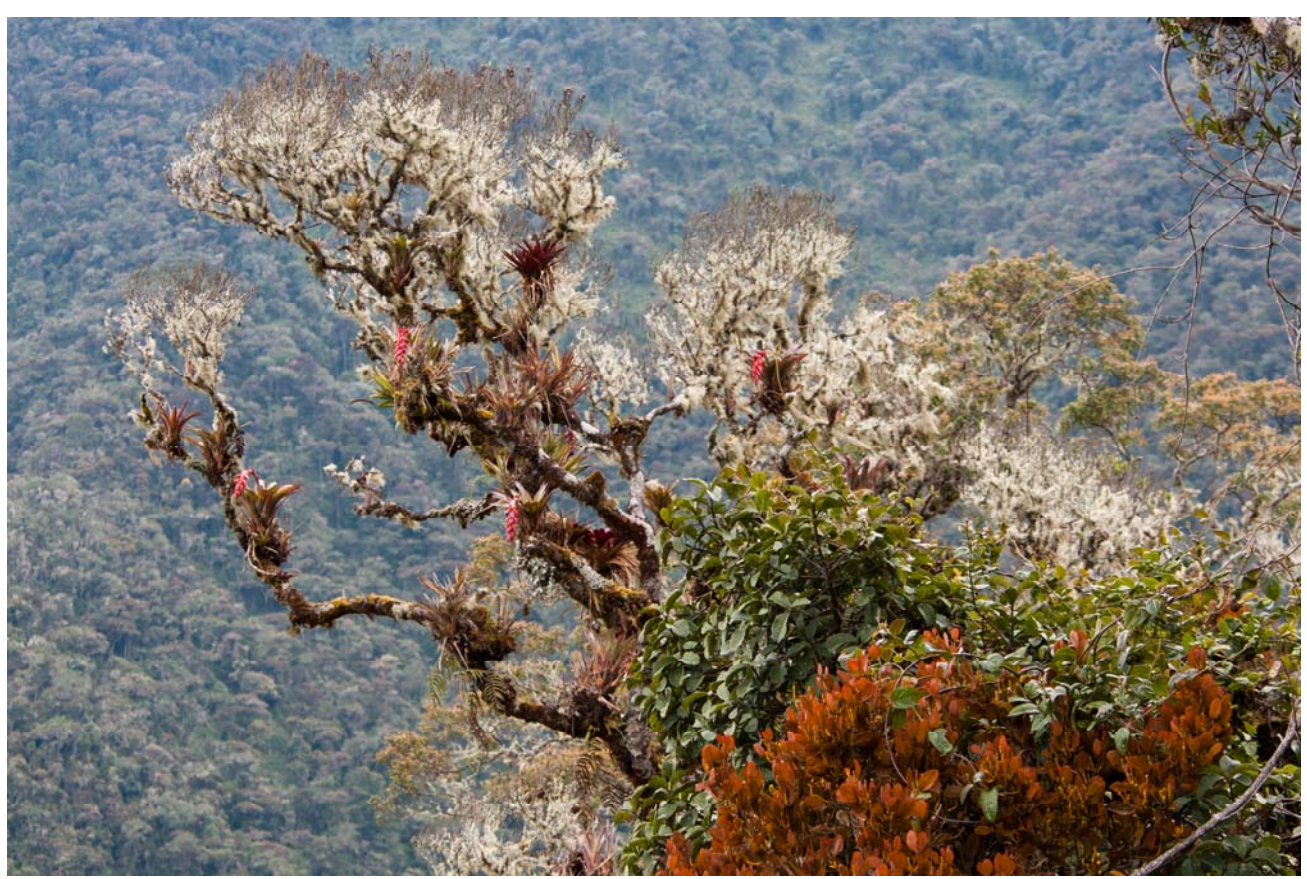
High altitude forest at ~3,300m ASL (RNA Colibrí del Sol)