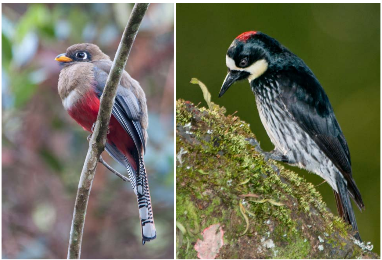
Collared Trogon [female] (RNA Arrierito Antioqueño); Acorn Woodpecker (near to Medellín)