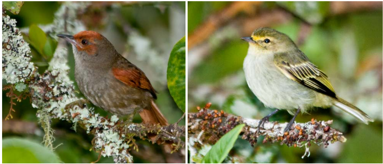
Red-faced Spinetail; Golden-faced Tyrannulet (both RNA Las Tángaras)