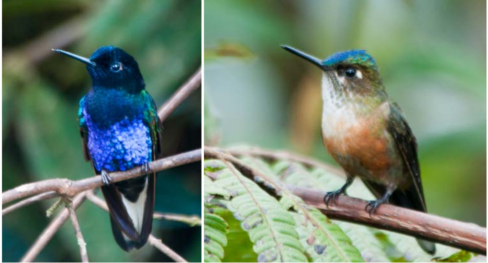
Velvet-purple Coronet; Long-tailed Sylph [female] (both RNA Las Tángaras)