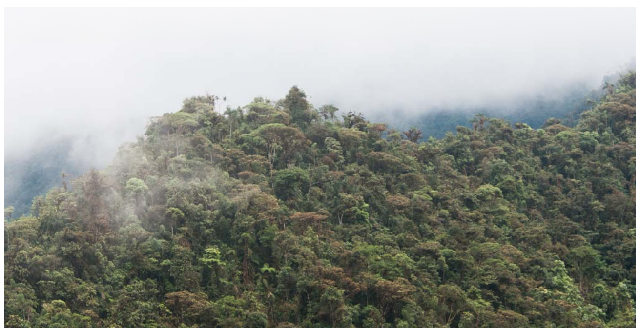
Chocó Forest at ~2,000m altitude (RNA Las Tángaras)