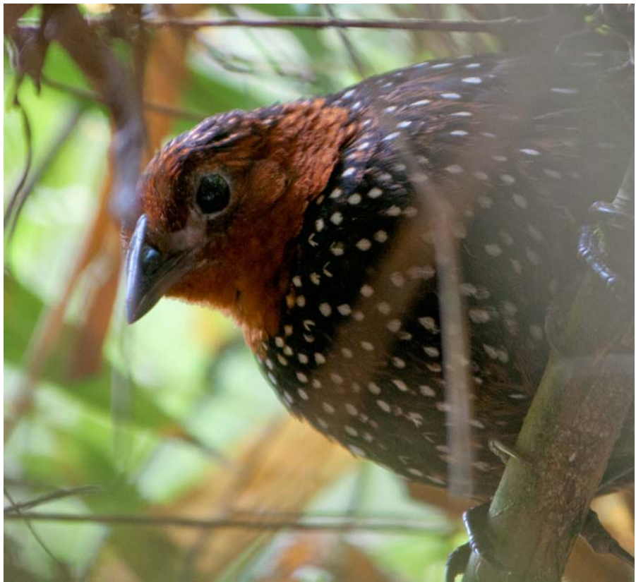
Ocellated Tapaculo (RNA Colibrí del Sol)