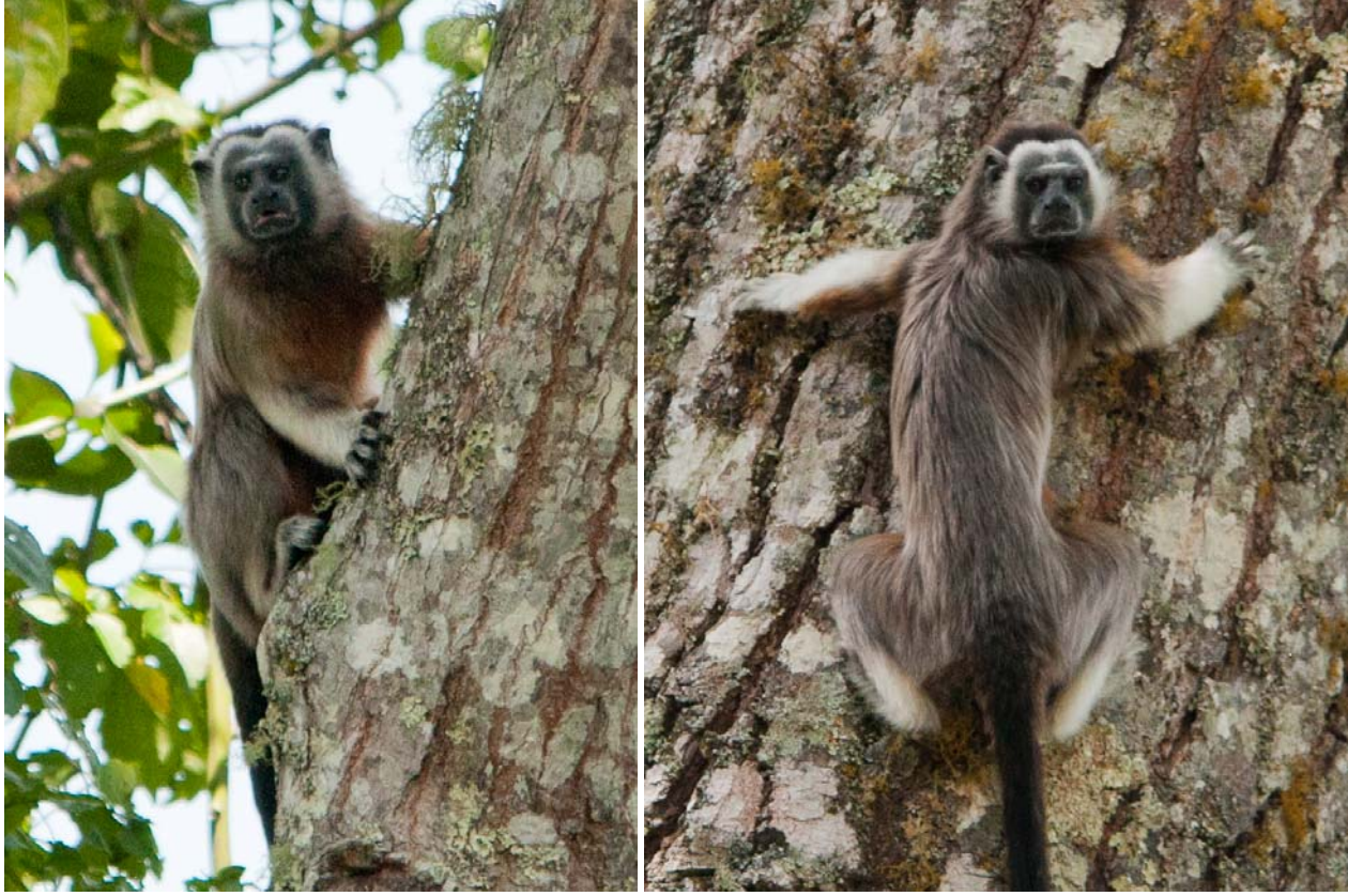
White-footed Tamarin (between Medellín and RNA Arrierito Antioqueño)