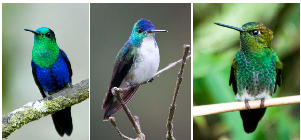
Green-crowned Woodnymph (RNA Arrierito Antioqueño); Andean Emerald; Greenish Puffleg (both RNA Las Tángaras)