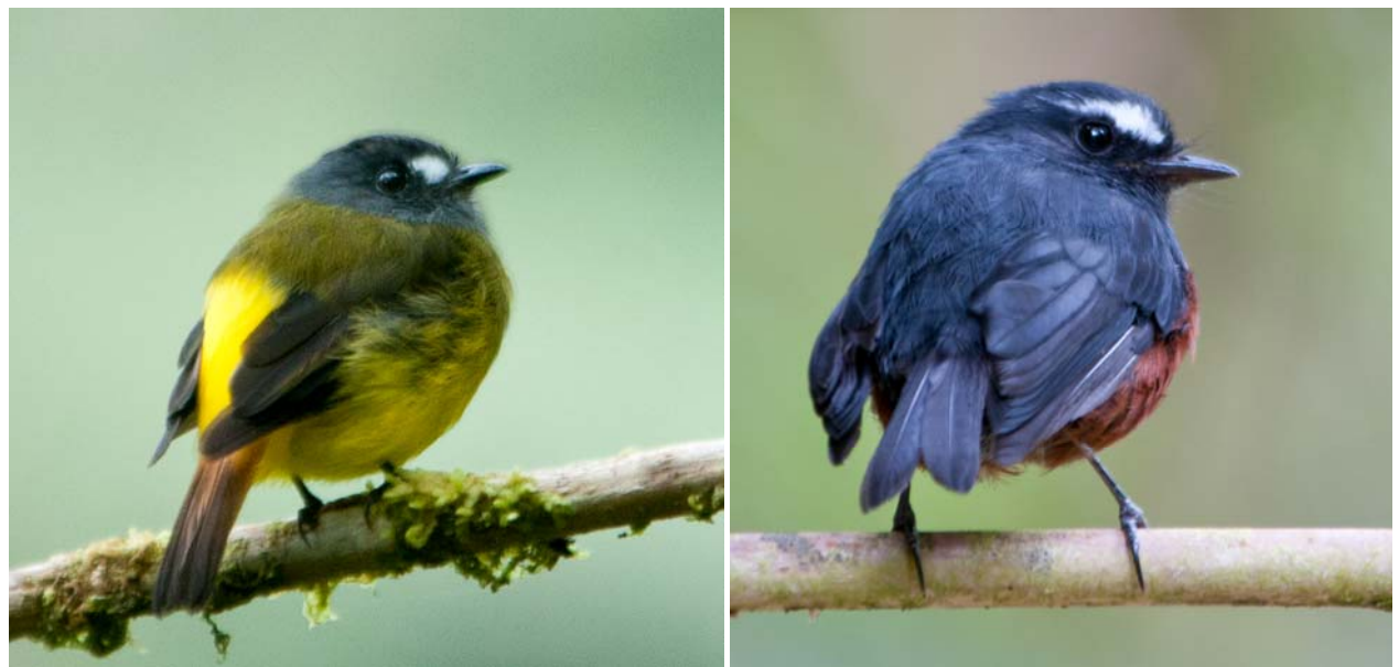
Ornate Flycatcher (RNA Las Tángaras); Slaty-backed Chat-Tyrant (RNA Colibrí del Sol)