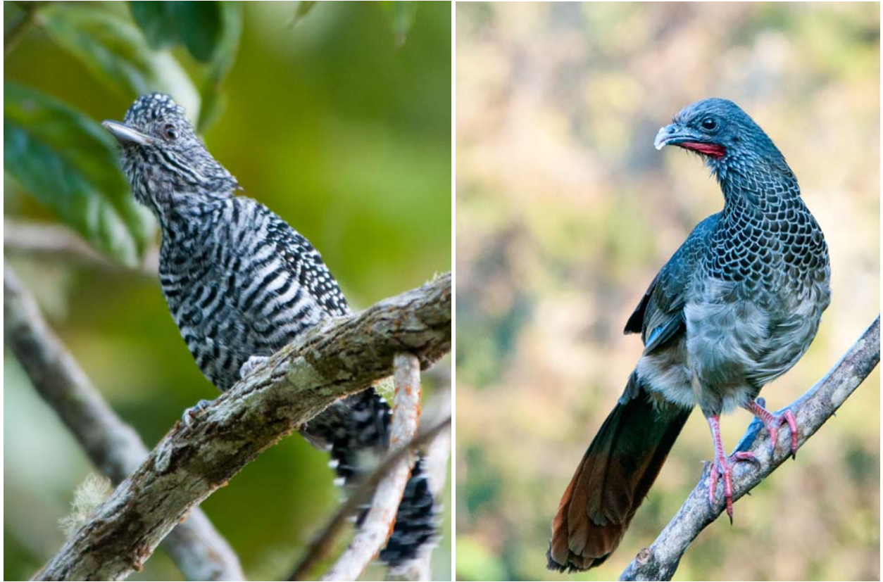
Bar-crested Antshrike; Colombian Chachalaca (both at RNA Las Tángaras)