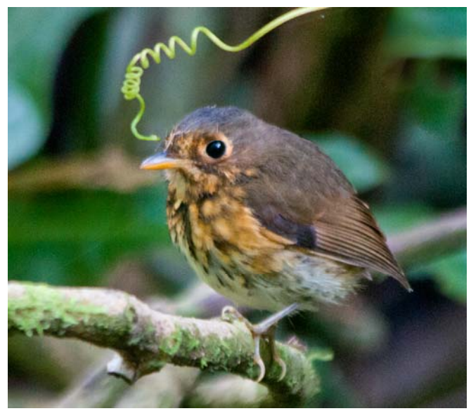
Ochre-breasted Antpitta (RNA Arrierito Antioqueño)