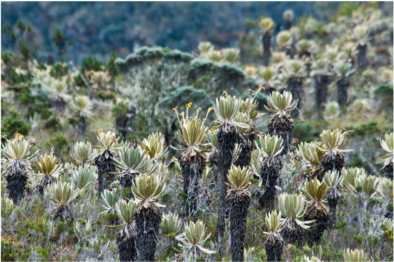
The summit of the Páramo del Sol at ~3,600m altitude (RNA Colibrí del Sol)