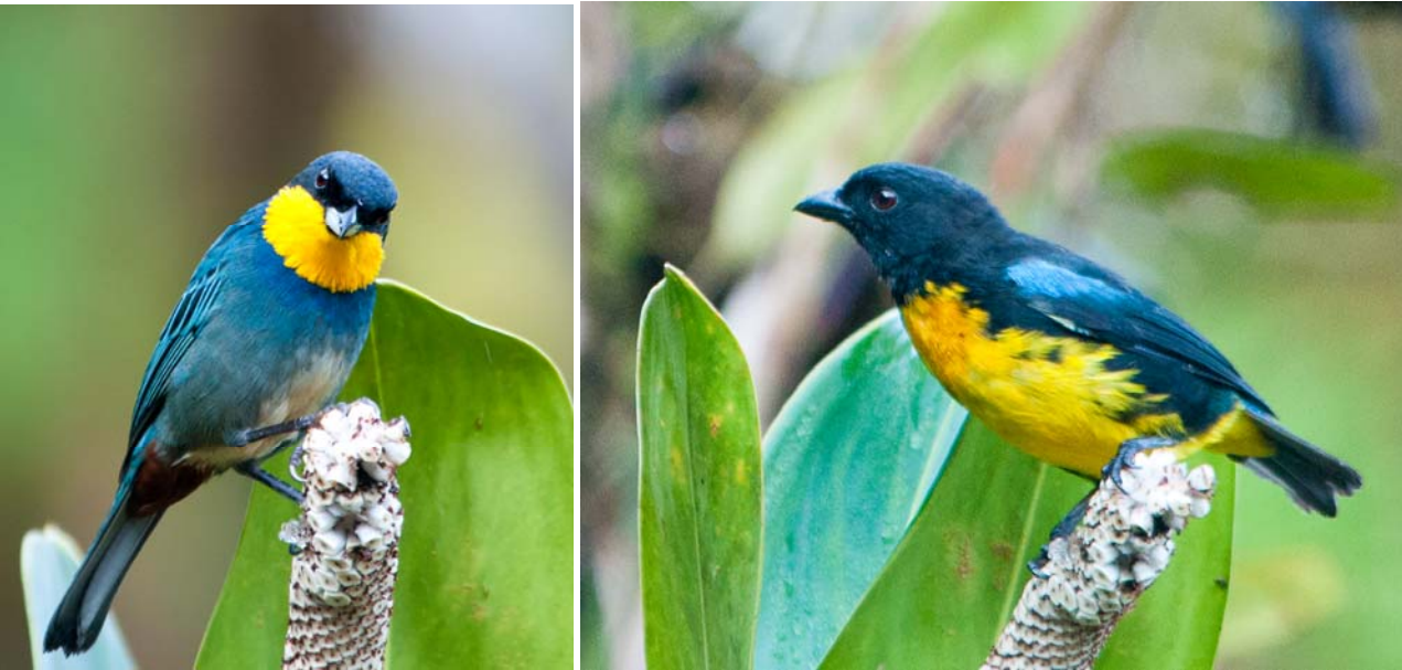
Purplish-mantled Tanager; Black-and-gold Tanager (both RNA Las Tángaras)