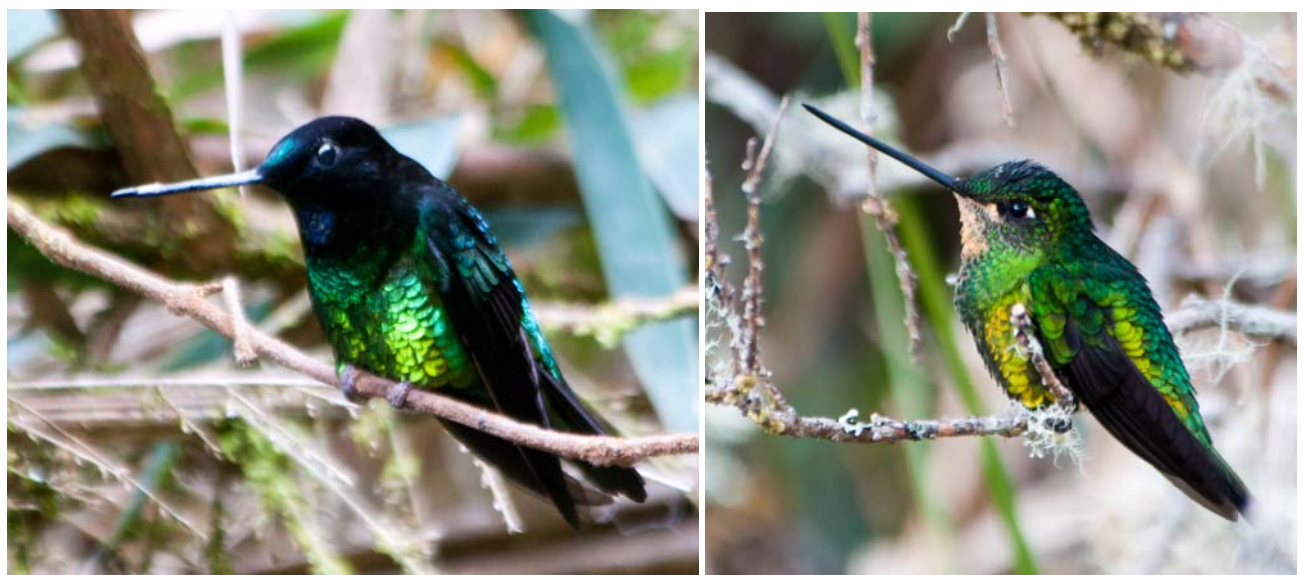
Dusky Starfrontlet [male & female] at the edge of the Páramo del Sol (both RNA Colibrí del Sol)