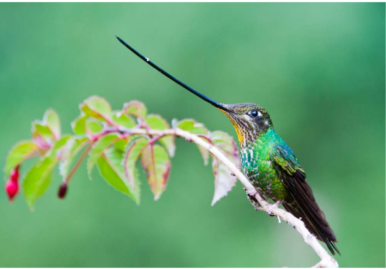
Sword-billed Hummingbird [female] (RNA Colibrí del Sol)