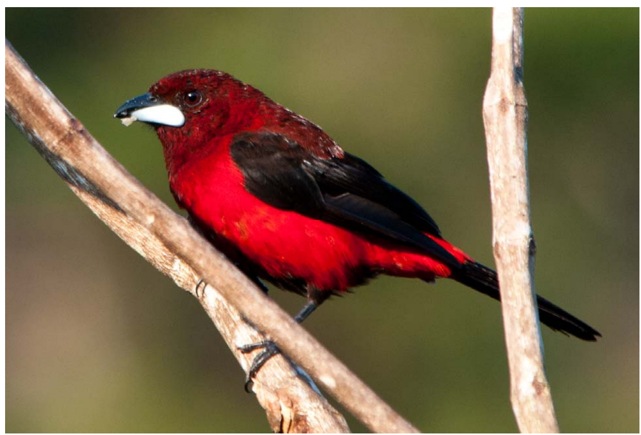
Crimson-backed Tanager (RNA Arrierito Antioqueño)