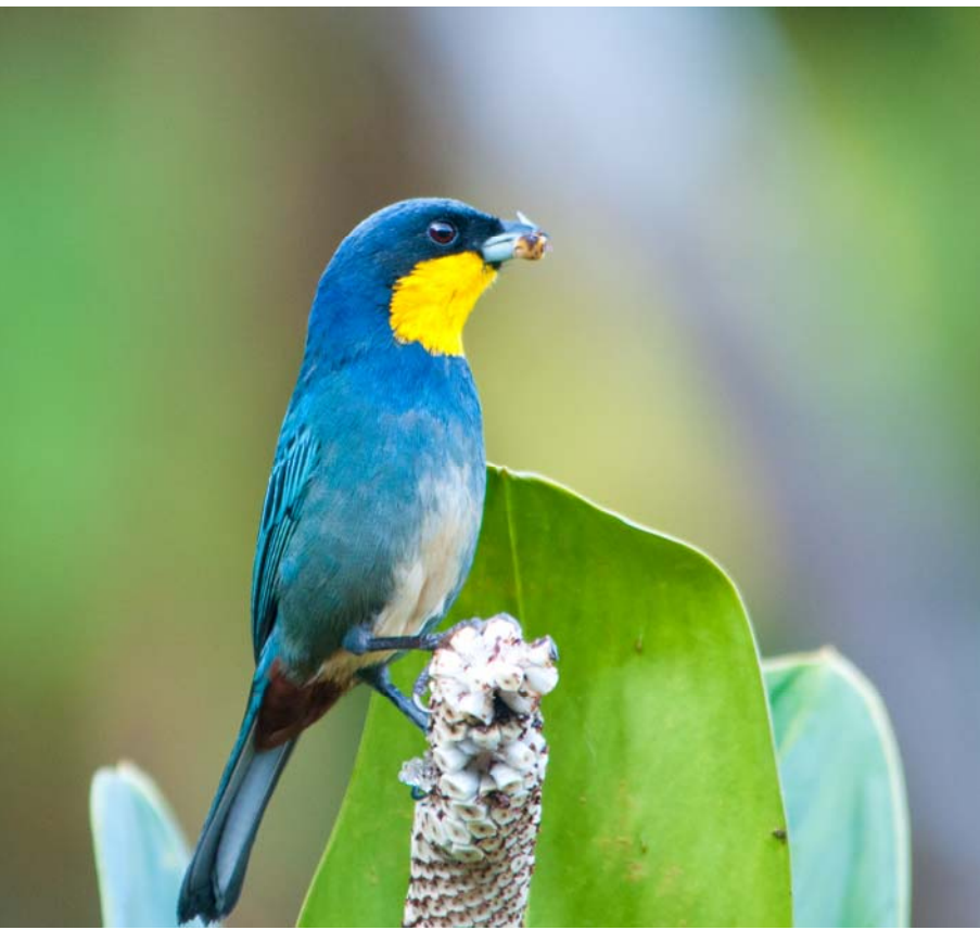
Purplish-mantled Tanager (RNA Las Tángaras)

Having previously birded in the Eastern Cordillera of the Andes near to Bogotá and the northern mountains near to Santa Marta, my second trip to Colombia was focused on three hotspots of avian endemism within a day's drive of Medellín - specifically the Arrierito Antioqueño (3 nights), Las Tángaras (3 nights) and Colibrí del Sol (2 nights) reserves in the Central and Western Cordillera. See the locations indicated on the map on page 18 of this report and <u>www.proaves.org</u> for further details on the reserves. All logistics, including transport between the reserves, accommodation at each reserve's high quality lodge, and guiding by the local reserve rangers, were efficiently arranged by EcoTurs (<u>www.ecoturs.org</u>). The whole trip ran extremely smoothly, with the dry weather at this time of year certainly helping our progress as we navigated the often steep, winding and occasionally very rough and landslide prone roads in this part of the country.