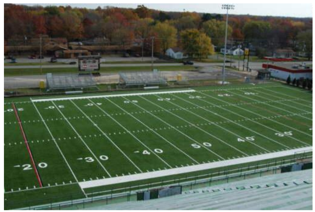
Northeastern State University Gable Field at Doc Wadley Stadium