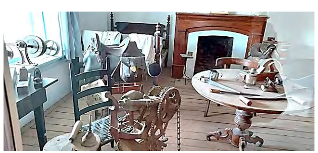
many artifacts displayed.

Lunch was on your own and we met at 4:30 for happy hour.