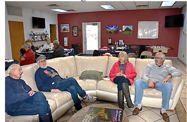
Job" along with popcorn to finish off a fun filled day.

we had an entertaining movie called the "Italian