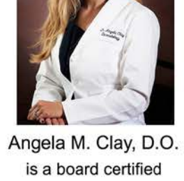
dermatologist serving aesthetic, medical and surgical skin conditions.

26036 Pontiac Trail, South Lyon, MI 48178 Phone: (248) 479-2200 • Fax: (248) 479-2682