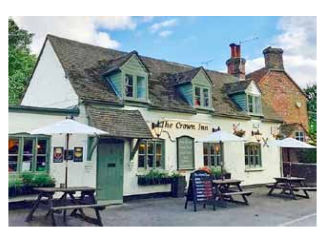
Saturday - Midday until late Food from Midday until 3pm, then 5pm to 8.30pm

Tuesday - Friday 4pm until late Food from 5pm until 8.30pm