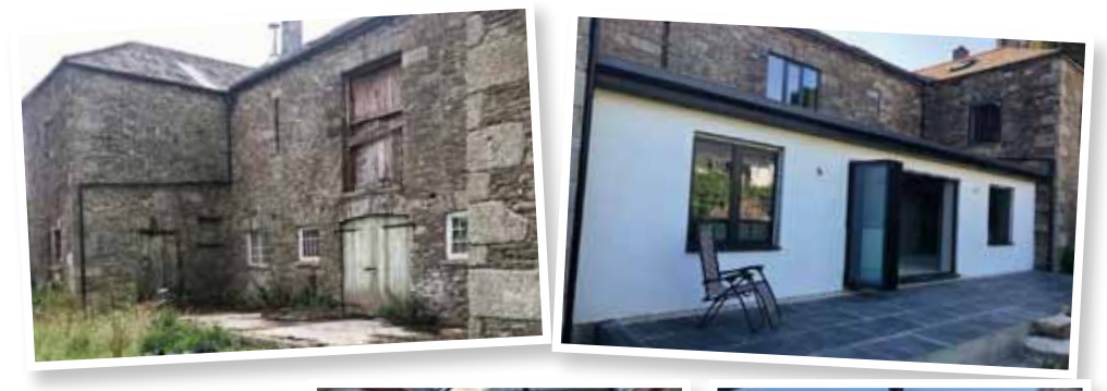
The rear of the barn has had an orangery extension for the kitchen/diner with the most amazing lantern lights.