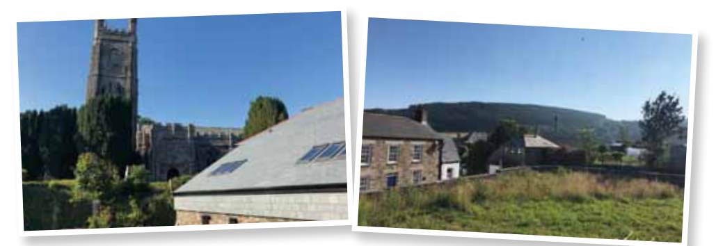
Stunning village setting with views across to Bodmin Moor