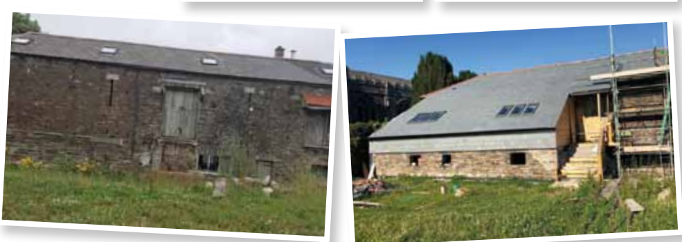
The front extension will be the new Blooberry office with a workshop on the lower floor.