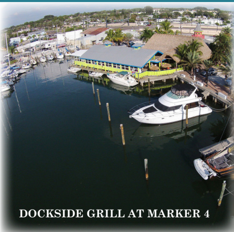
DOCKSIDE GRILL AT MARKER 4