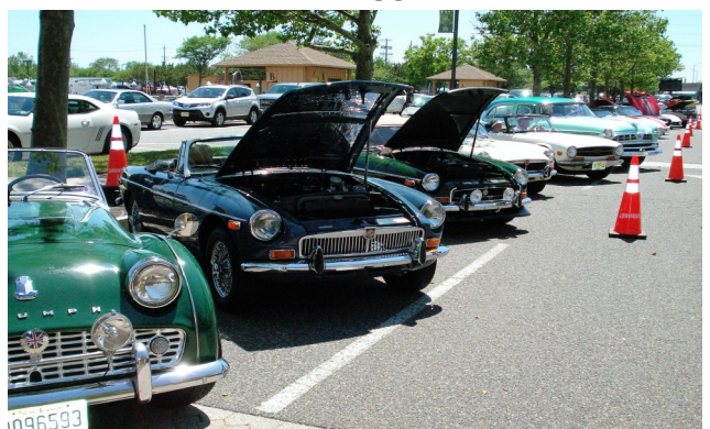
News and Articles