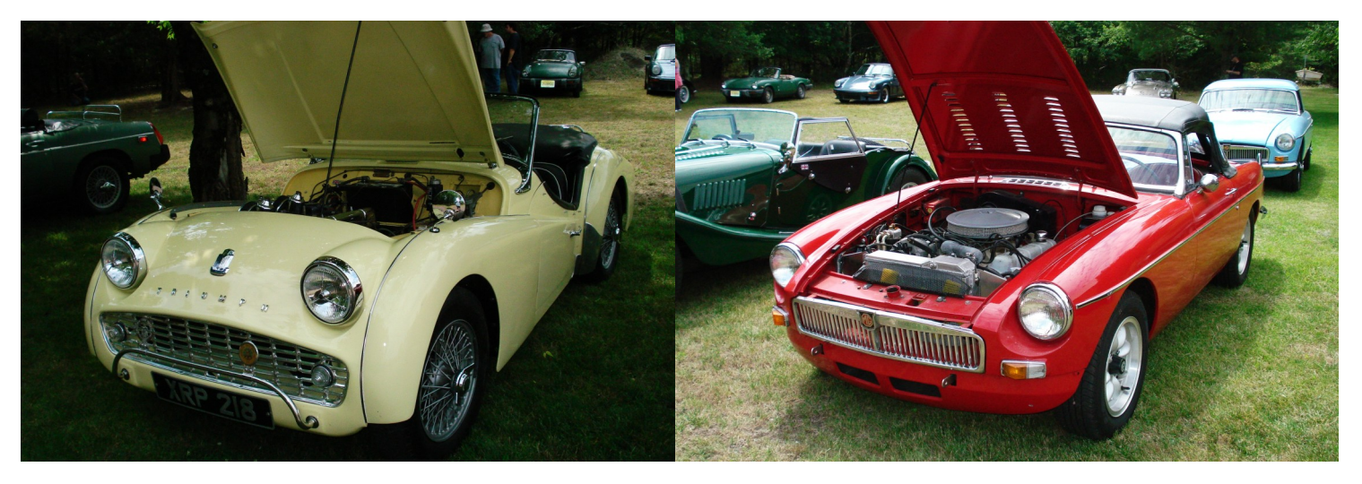
Bruce Aydelotte's '61 Triumph TR-3A