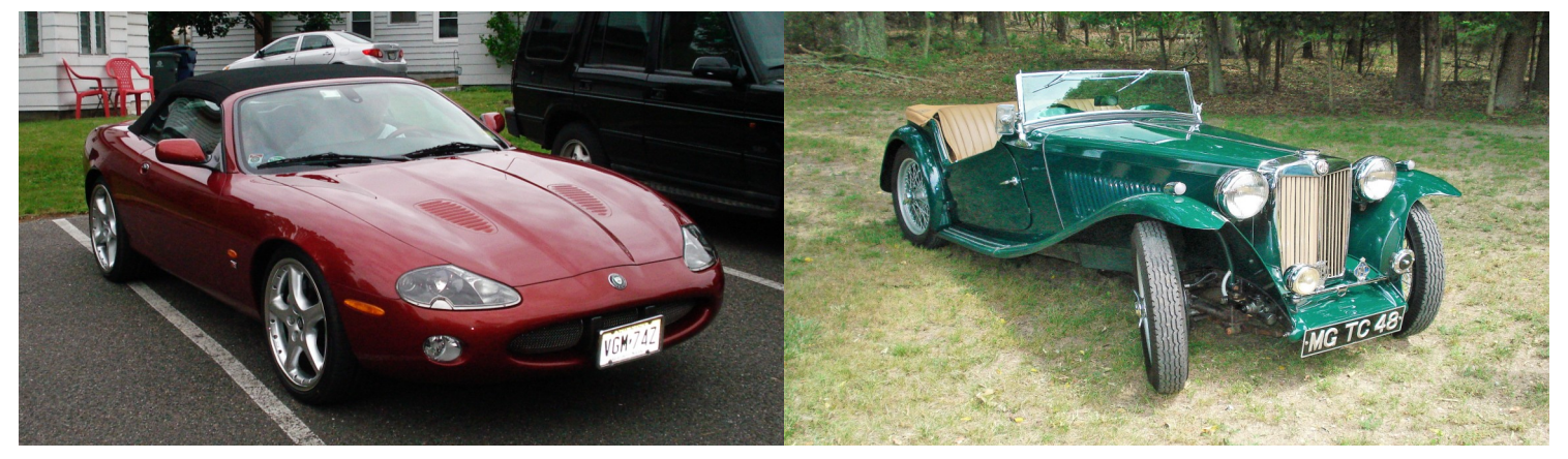
(above) Joe Picogna's 2004 Jaguar in W'town (below) Golden Nugget 7 car line up