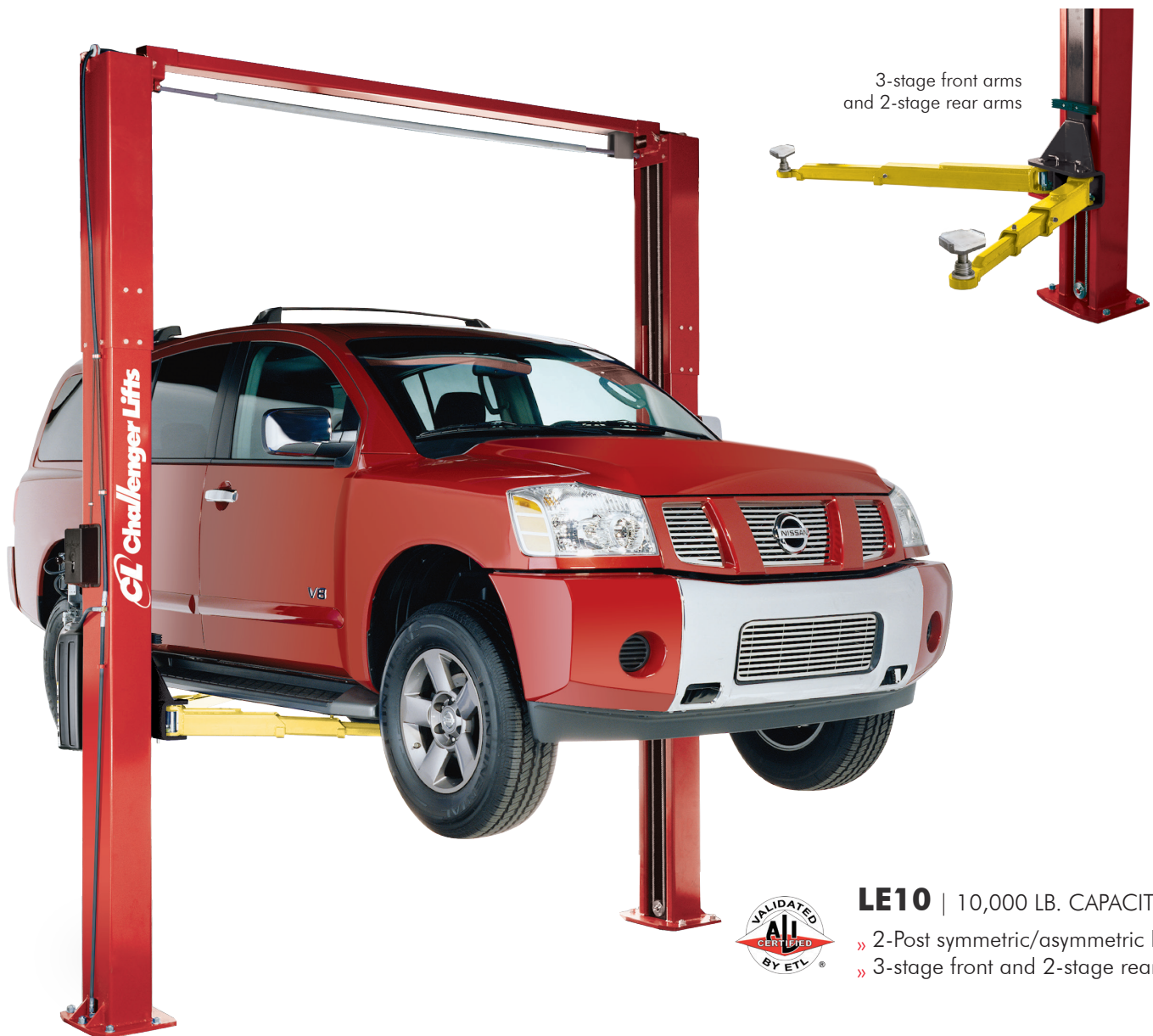
3-stage front arms and 2-stage rear arms

With double telescoping screw pads, durable powder coat finish and plated arm restraints and pins, the LE10 accommodates the rigorous demands of a full-service facility. Raise it even higher with optional column height extensions, which provide an additional 2 feet of overhead clearance. Lifts are available in red or blue.