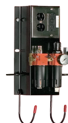
Air electric work station

2' column height extensions accommodate higher profile vehicles