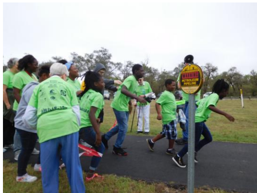
Picture from 2018 CROP Walk

Every volunteer who works the day of the walk