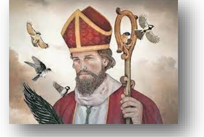
Feast Day: February 14