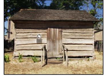
Potter Watson Cabin circa 1850s