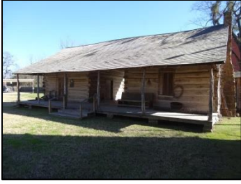
Carter Cabin circa 1845