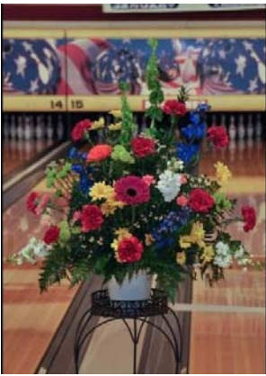
Flowers for opening