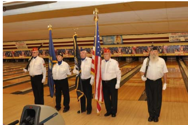
Bay County Vet's Council Honor Guard