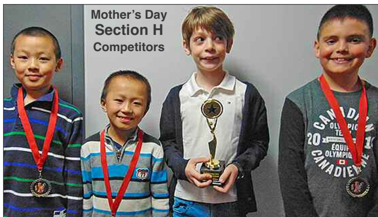
Mother's Day Section H Competitors