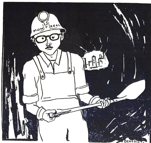
and Forget Annexation.