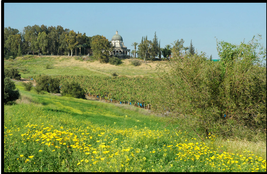
Site of Sermon on the Mount with Church of the Beatitudes at top.

Remez: “Now when Jesus saw the crowds, he went up on a mountainside ...” (Matt 5.1) What does this remind us of? Were the disciples supposed to “get it?”