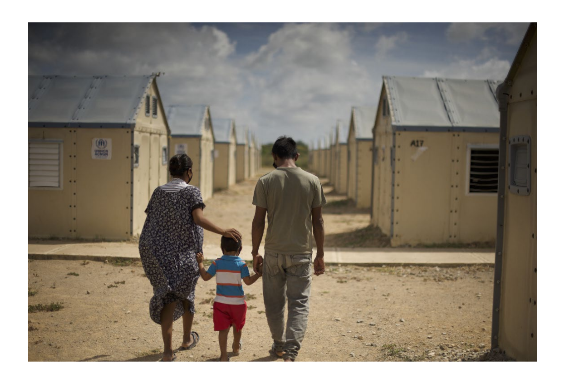
Figure 3. A family displaced by conflict walks through a settlement.<sup>15</sup>

"This rigorous evaluation shows that an infusion of cash at a time of vulnerability can have positive, lasting impacts in improving food and economic security and preventing people from having to turn to damaging, desperate measures." Carlos Alviar, Chief of the Party of the ADN Dignidad project, added that timely humanitarian interventions such as this one may also prevent further migration. "As we improve economic recovery, we're also hoping to reduce the need to migrate again," he said. "For migrant populations coming to Colombia [for example, from