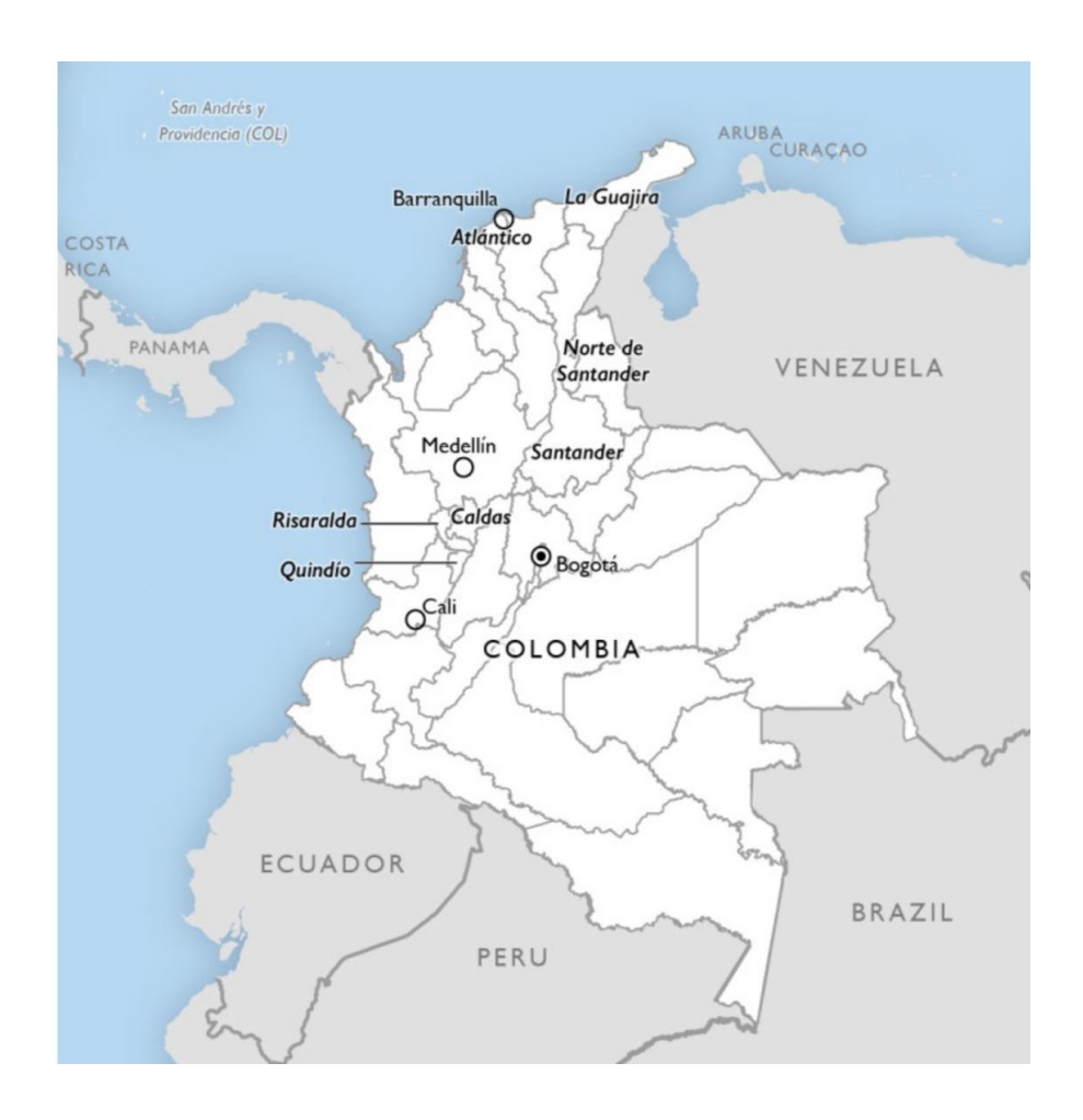
Figure 1: Map of Colombia (USAID, 2023)<sup>6</sup>

Today, migrants from Venezuela in Colombia represent 5 percent of the total population. The impacts of the crisis are geographically concentrated. Approximately 7 departments in Colombia (out of 32 departments, plus Bogotá) host 70 percent of all migrants from Venezuela. The 2023 Regional Refugee and Migrant Response Plan identified more than 5.4 million people in Colombia affected by the crisis in Venezuela, including Venezuelan migrants and refugees, Colombian returnees, and host community members, who need humanitarian assistance.