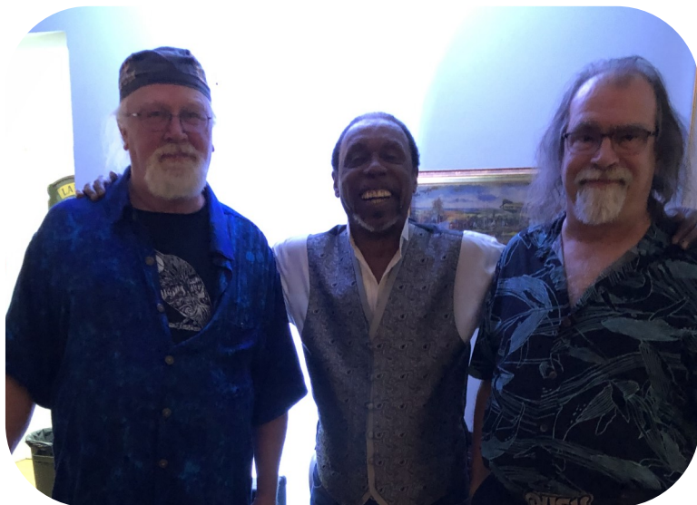
The Band — Sons of Guns