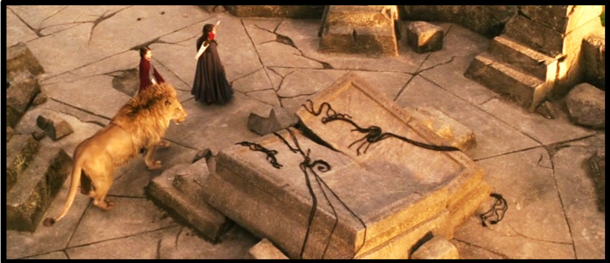
The Stone Table from The Lion, the Witch and the Wardrobe

(The images here are from the book, The Lion, the Witch and the Wardrobe . If you have never read [or can't remember well] CS Lewis's book, The Lion, the Witch and the Wardrobe , this might be a good read for this lesson. The movie is nowhere near as good.)