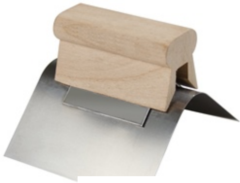
3-1/2"x2-1/2" Stainless Steel Outside Corner Tool - 1/8"R