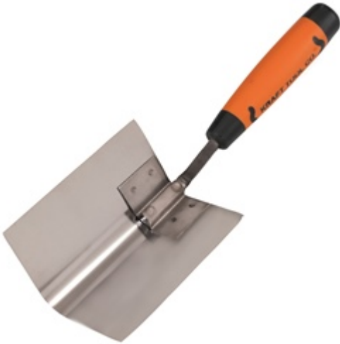
Bullnose Outside Corner Tool with ProForm Soft Gr Handle