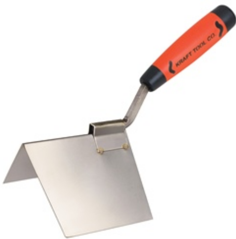
Large Outside Corner Tool with ProForm Soft Grip Handle