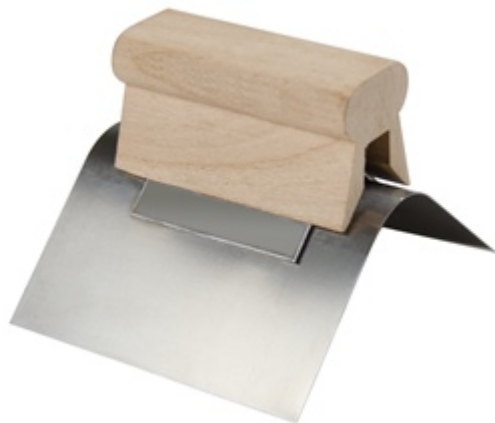
3-1/2"x2-1/2" Stainless Steel Outside Corner Tool - 3/4"R