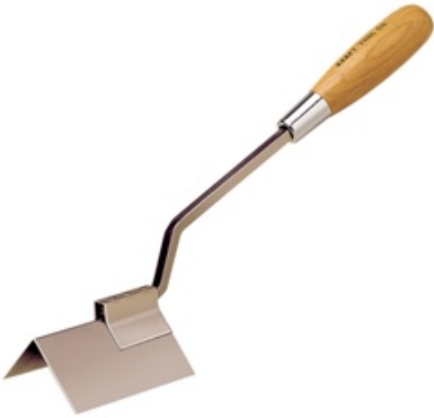
2"x3" Outside Drywall Corner Tool with Long Handle