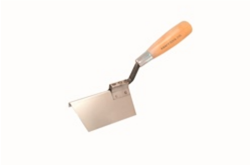
2-1/2" Outside Drywall Corner Tool