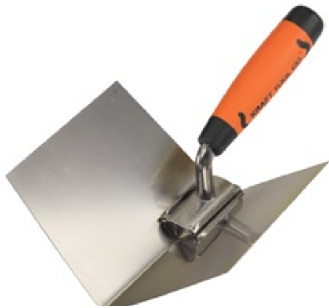
Inside Corner Tool with ProForm Soft Grip Handle