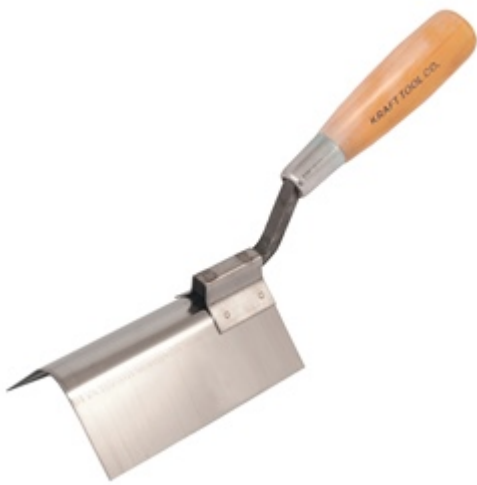
5" Bullnose Outside Corner Tool w/Wood Handle