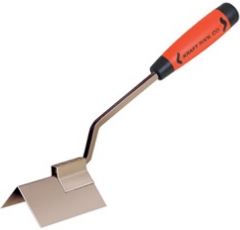
Outside Drywall Corner Tool with Long ProForm ® So Grip Handle DW519PF