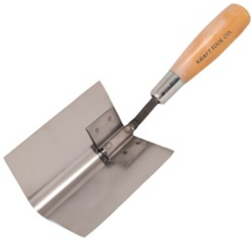
5" Bullnose Inside Corner Tool w/Wood Handle