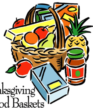
Thanksgiving Food Baskets

Shir Chadash service or event and can be picked up, until Saturday, November 17 th . Contact Sandy regarding turkey pick up.